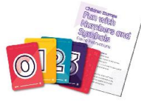
A set of 61 physical cards and game instructions