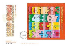
Serviced First Day Cover affixed with a souvenir sheet.