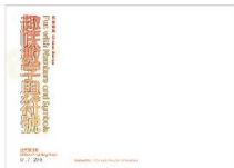
First Day Cover