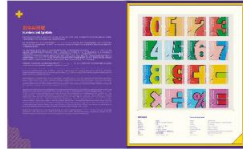
Numbers Pack (Inside)