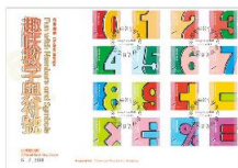
Serviced First Day Cover affixed with a set of 16 stamps.