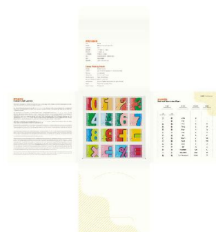
Presenter Pack (Inside)