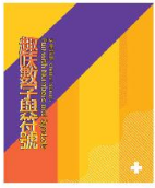
Numbers Pack (Cover)