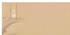
First Day Cover