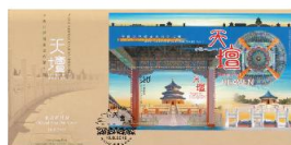
Serviced First Day Cover affixed with a Stamp Sheetlet