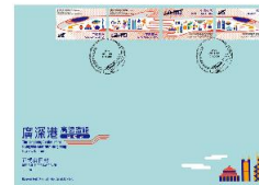
Serviced First Day Cover affixed with a set of 4 stamps.