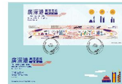
Serviced First Day Cover affixed with a Souvenir Sheet.