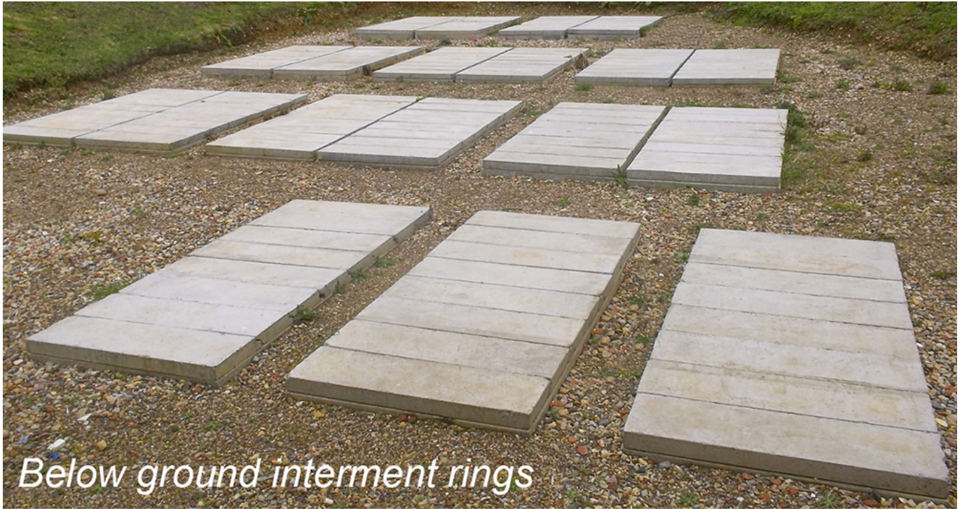
Below ground interment rings