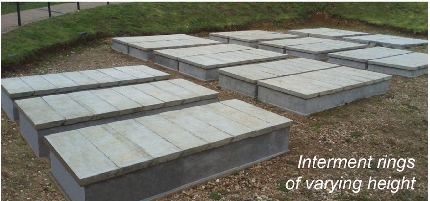
Interment rings of varying height

The post Interment Rings appeared first on Latest News .