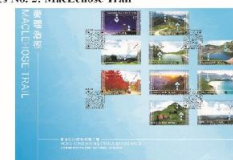
Serviced First Day Cover affixed with a set of gummed stamps of 10 designs and date-stamped with associated special postmark.