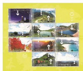
Self-adhesive Stamp Booklet (Inside).