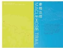
Presentation Pack (Cover).