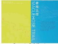
Presentation Pack (Cover).