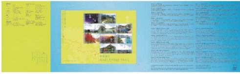
Presentation Pack (Inside).