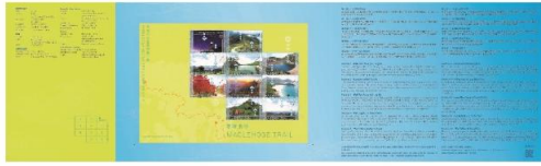
Presentation Pack (Inside).