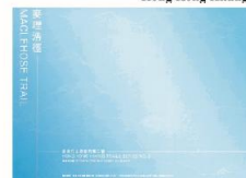
Blank First Day Cover.