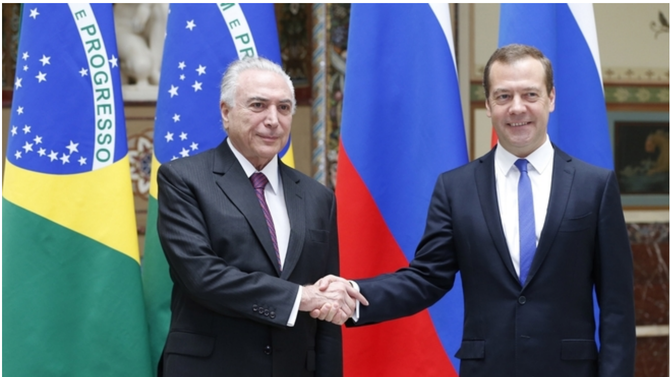
Meeting with President of Brazil Michel Temer