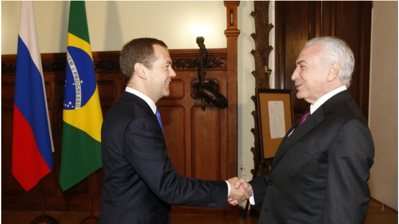
Meeting with President of Brazil Michel Temer