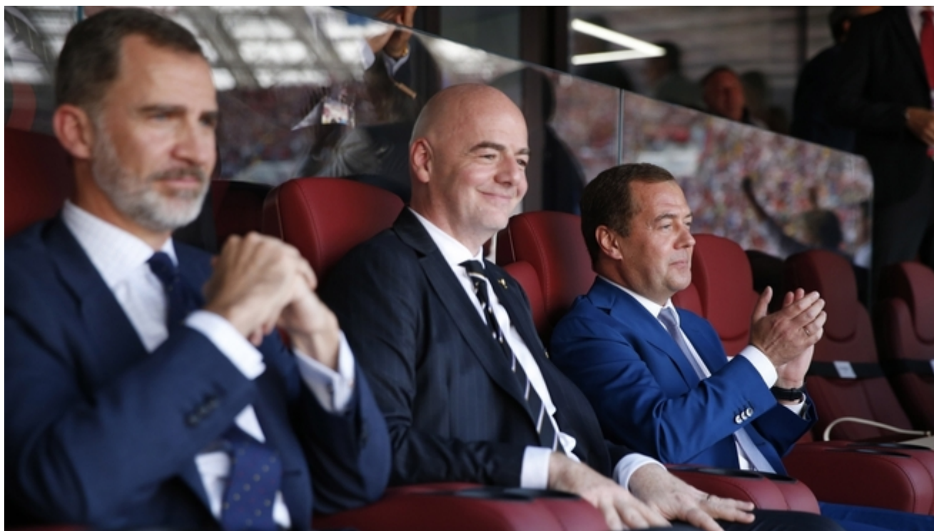
At Russia vs. Spain 2018 FIFA World Cup match