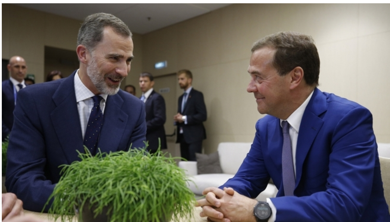
Meeting with King Felipe VI of Spain