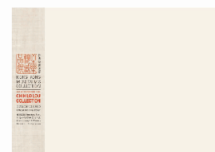
First Day Cover.