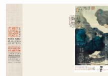
Serviced First Day Cover affixed with a S10 Stamp Sheetlet and date-stamped with associated special postmark.