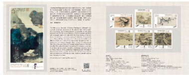
Presentation Pack (Inside).