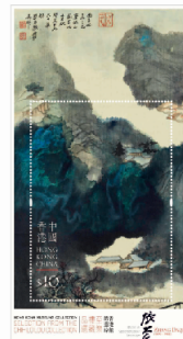
S10 Stamp Sheetlet.