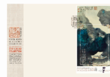
Serviced First Day Cover affixed with a S20 Stamp Sheetlet and date-stamped with associated special postmark.