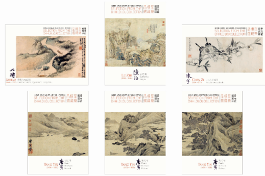
Postage Prepaid Picture Card (Air Mail).