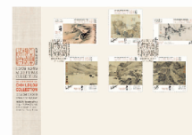
Serviced First Day Cover affixed with a set of 6 Stamps and date-stamped with associated special postmark.