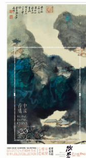
S20 Stamp Sheetlet (Cotton Stamp Paper).