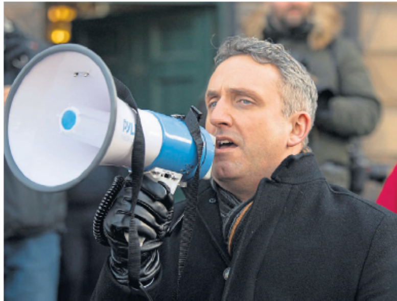
HEALTHY DEBATE: Scottish Lib Dem leader Alex Cole-Hamilton has called for action.