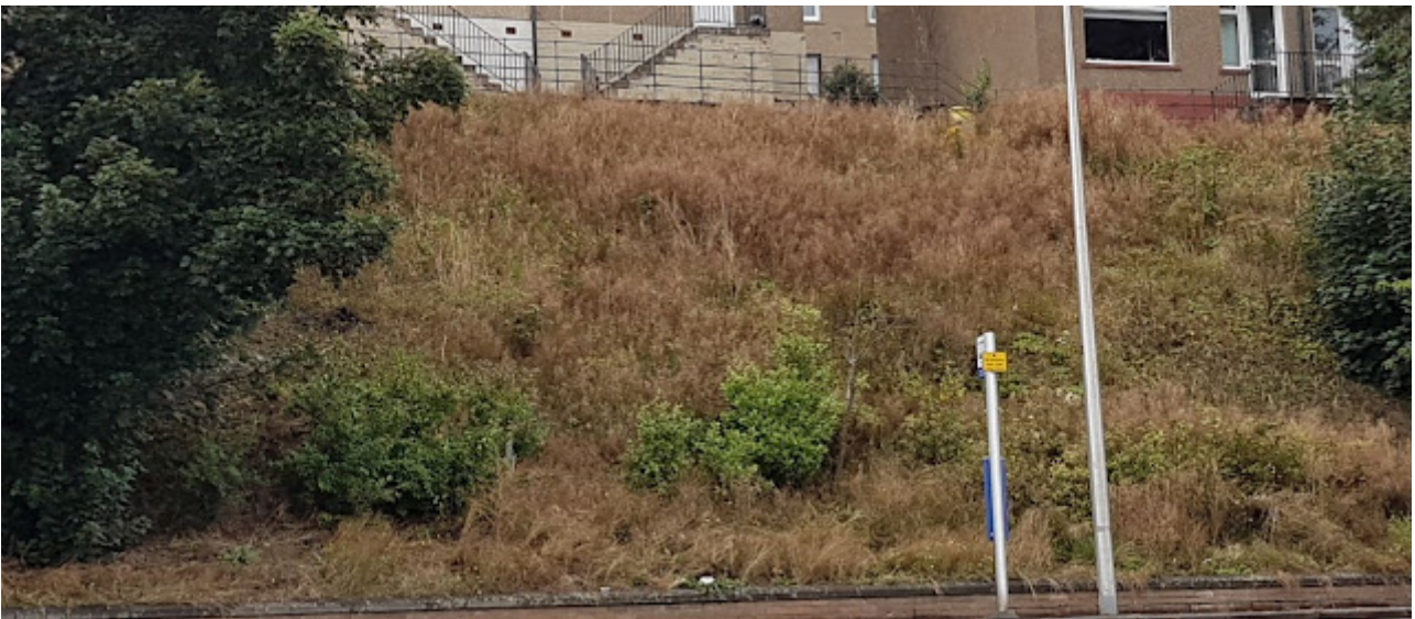
Slope in Pentland Avenue

It was agreed at the site visit that the overgrown area in Scott Street will be strimmed back in the near future.