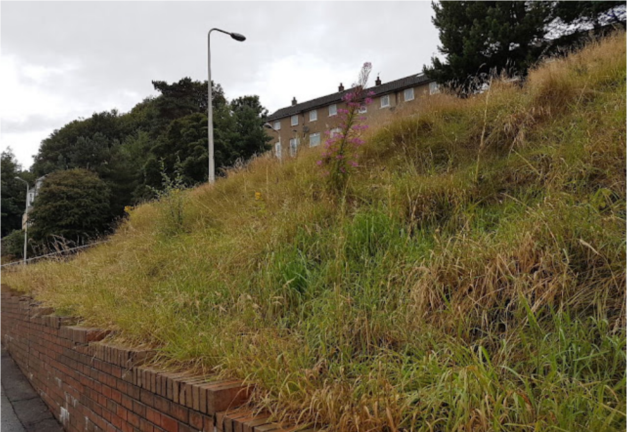
West end of Scott Street

Yesterday afternoon, I had a really useful site visit with council environment officers regarding the overgrown and unsightly sloped areas in Pentland Avenue and Scott Street – at the west end of each :