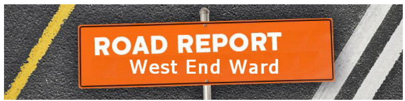
DUNDEE CITY COUNCIL - WEEKLY ROAD REPORT