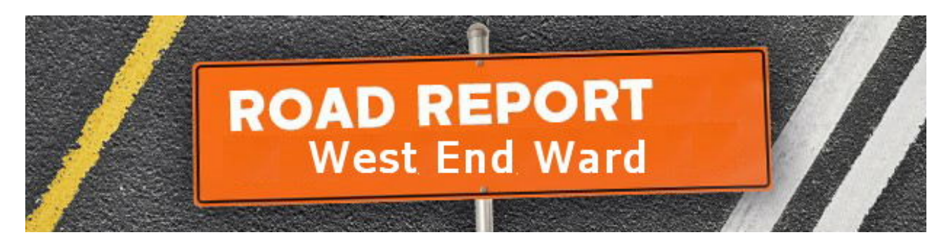
DUNDEE CITY COUNCIL - WEEKLY ROAD REPORT

Please note that most works are subject to change and late completion due to the restrictive measures in place following UK and Scottish Government advice that only emergency/urgent works and those considered essential should take place during this period.