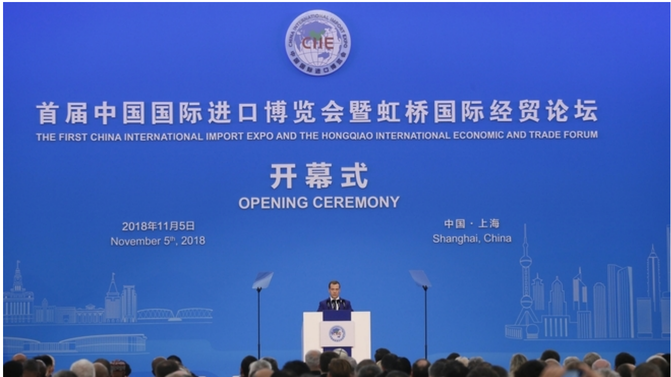
Dmitry Medvedev delivering remarks at the opening of the 1st China International Import Expo