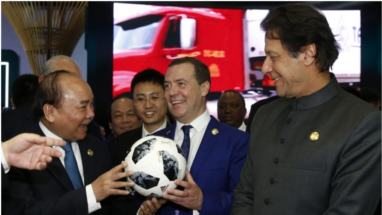
Visiting the 1st China International Import Expo