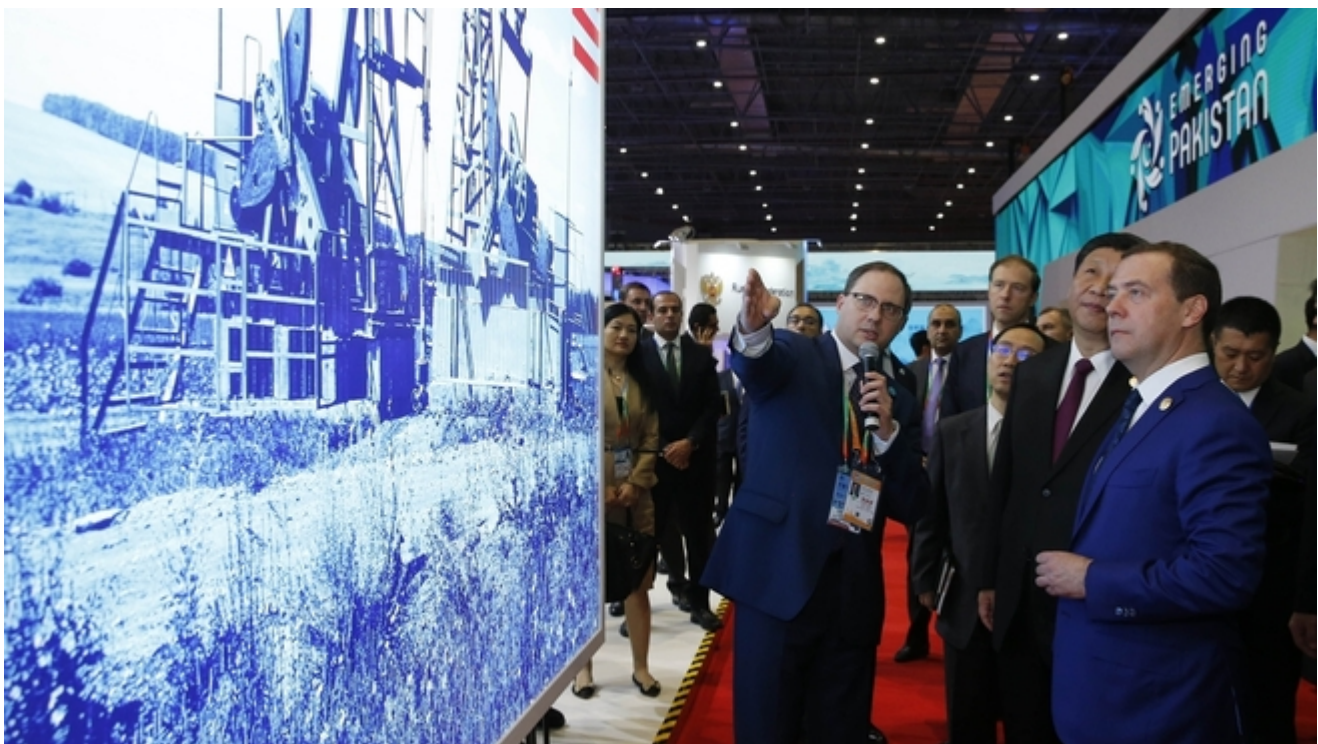
Visiting the 1st China International Import Expo