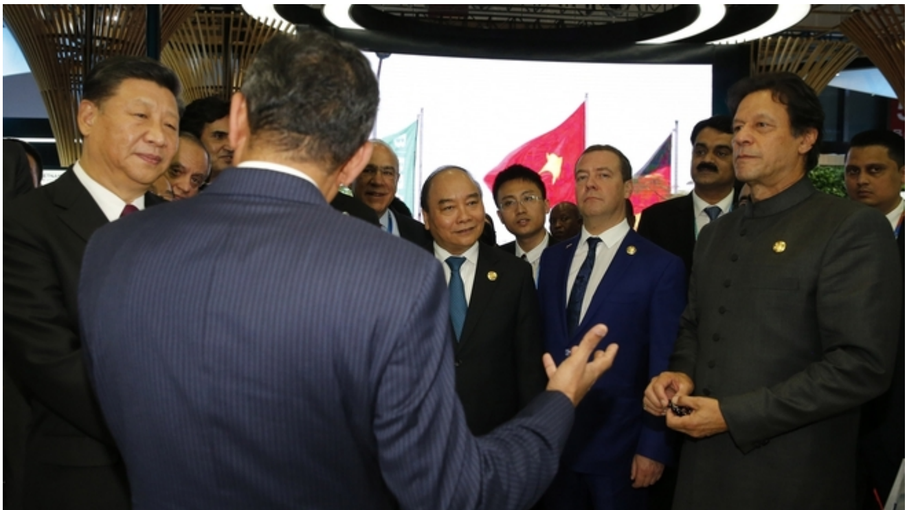
Visiting the 1st China International Import Expo