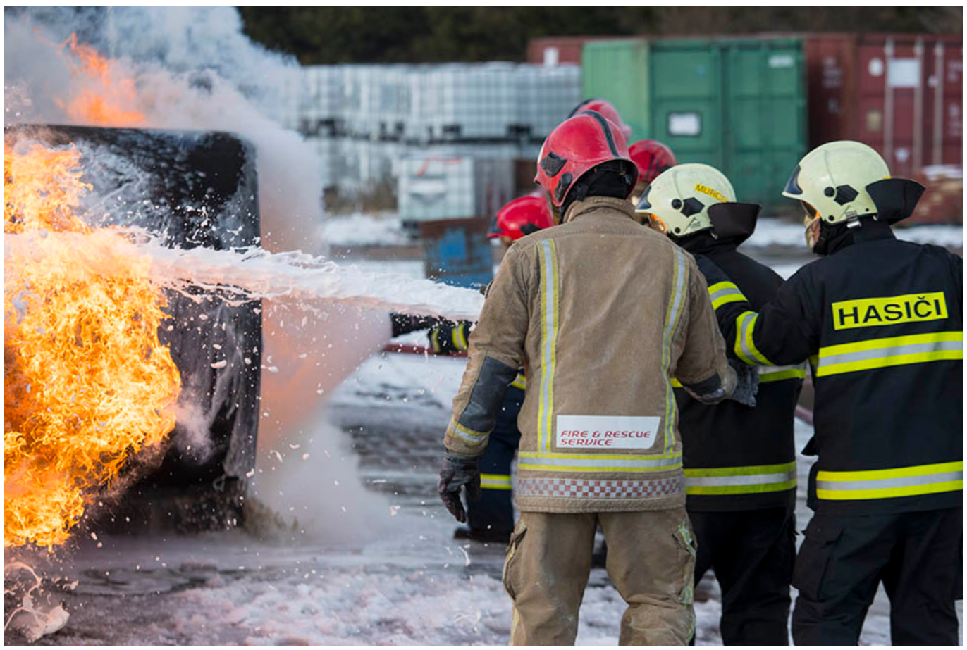
Six Slovakian Air Force firefighters have undergone training in the UK to learn vital skills needed to tackle major aircraft fires.

It is hoped that this course, the first time that the Slovakians have done this training in the UK, will lead to further opportunities for fire safety personnel from their country to come to Manston.