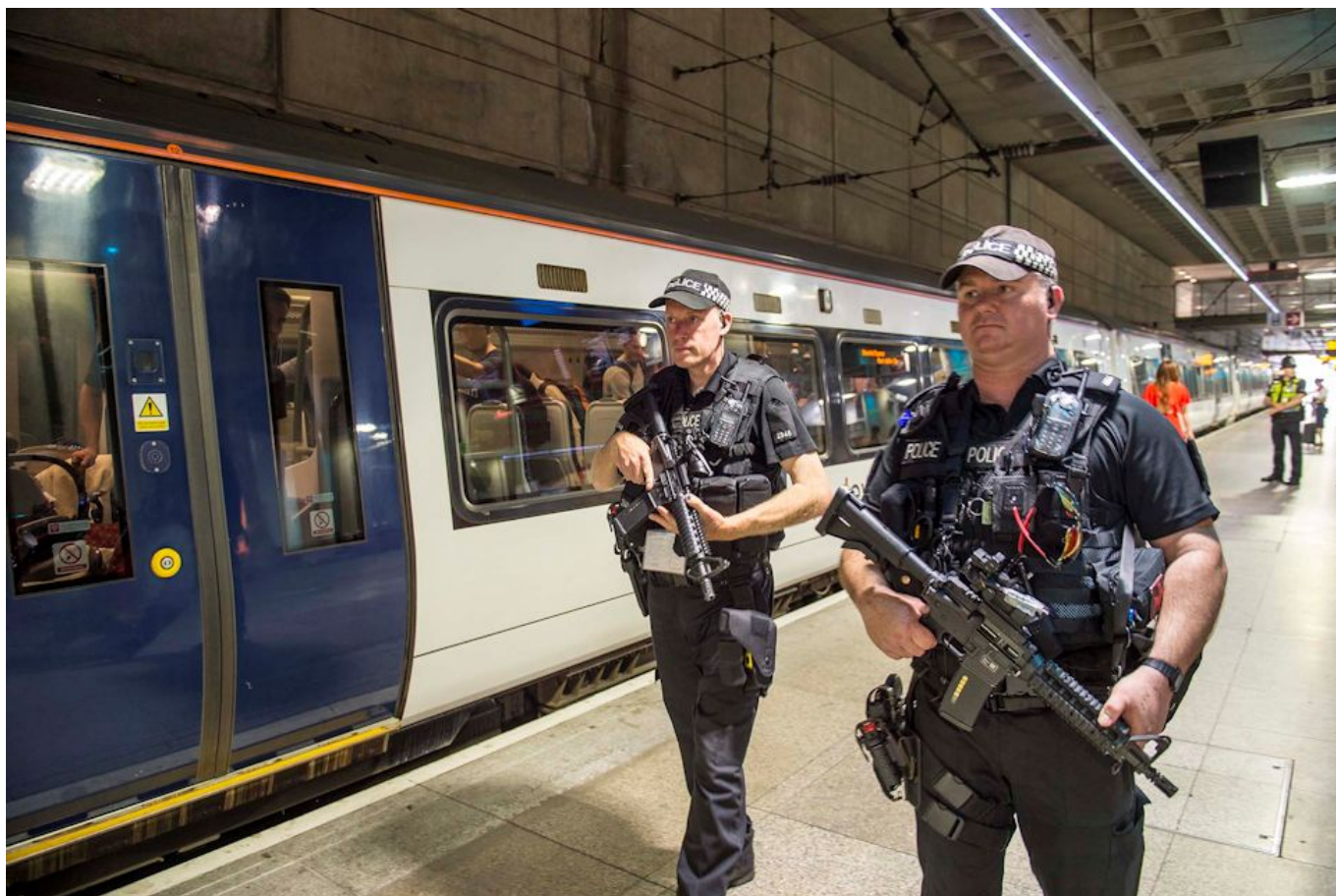
Deployment guarding the Stansted Express