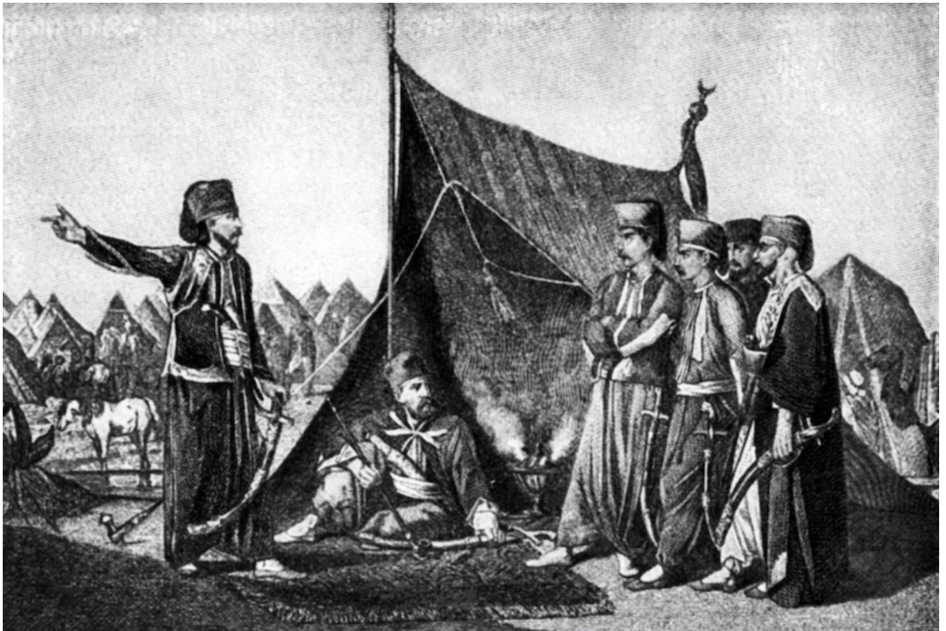
Greek War of Independence 1821 – 1829, Turkish general Ibrahim Pasha in front of his tent, wood engraving after drawing by Jeanron, circa 1827.

Yet the torch was carried on by rebels further south, in Peloponnesus, as the revolution was eventually crowned with success in 1830 when the full independence of the Greek state was recognized by the then great powers of the UK, France and Russia. In contrast with 1821, Europe's powers realized that Greek autonomy and its eventual independence served their interests better than open suppression.