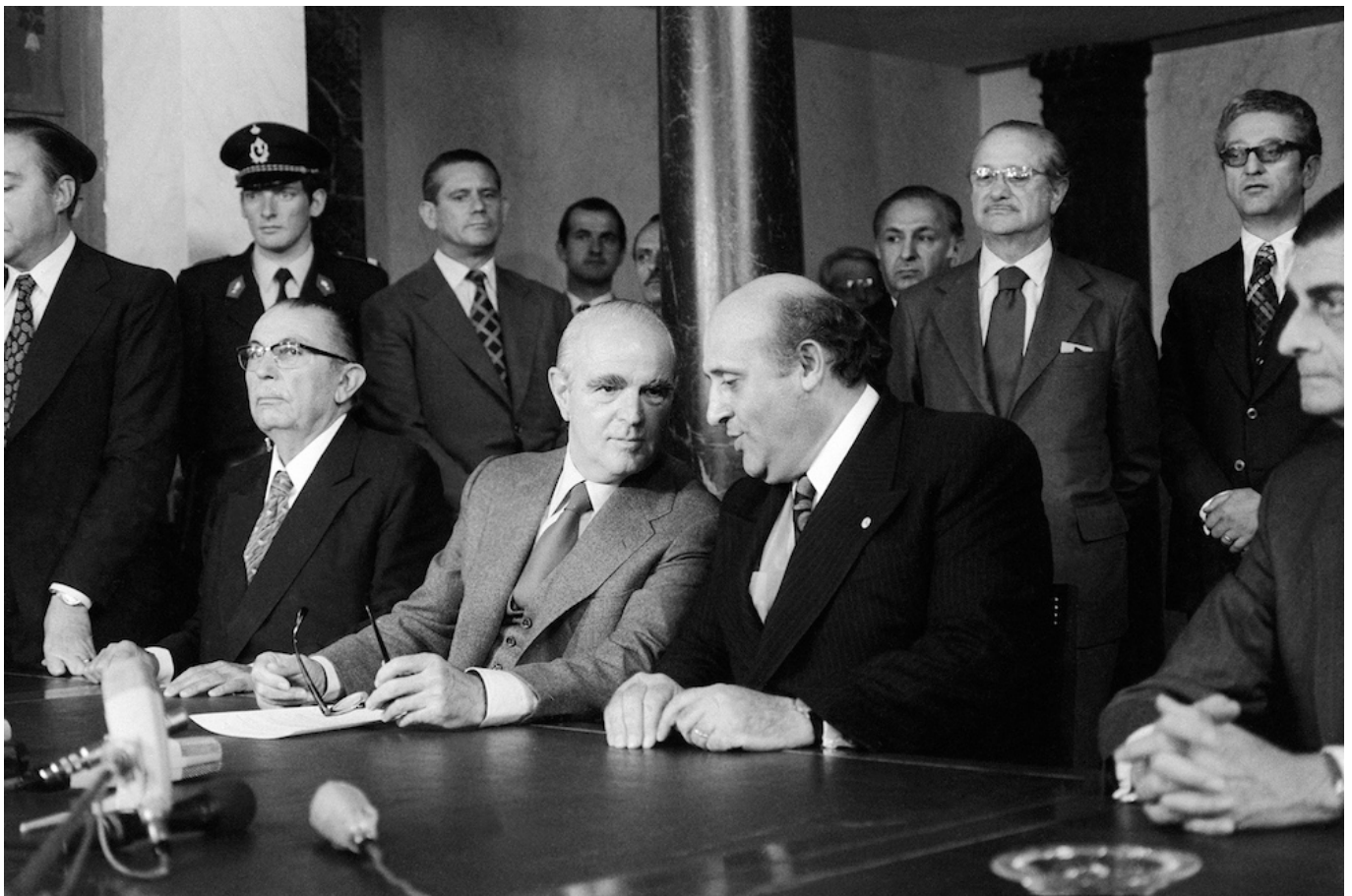
Greek Prime Minister Constantin Caramanlis (L) and Turkish Prime Minister Suleyman Demirel (R) talk during the first Greek-Turkish summit since the

Yet 10 years of continuous war had taken its toll and the irredentism manifested in the Greek army’s march deep into central Anatolia came to a crashing halt once Ataturk launched a devastating counterattack. Lausanne put an end to hostilities but not before Greece and Turkey embarked on a population exchange, with religion the main criterion for the exchange.