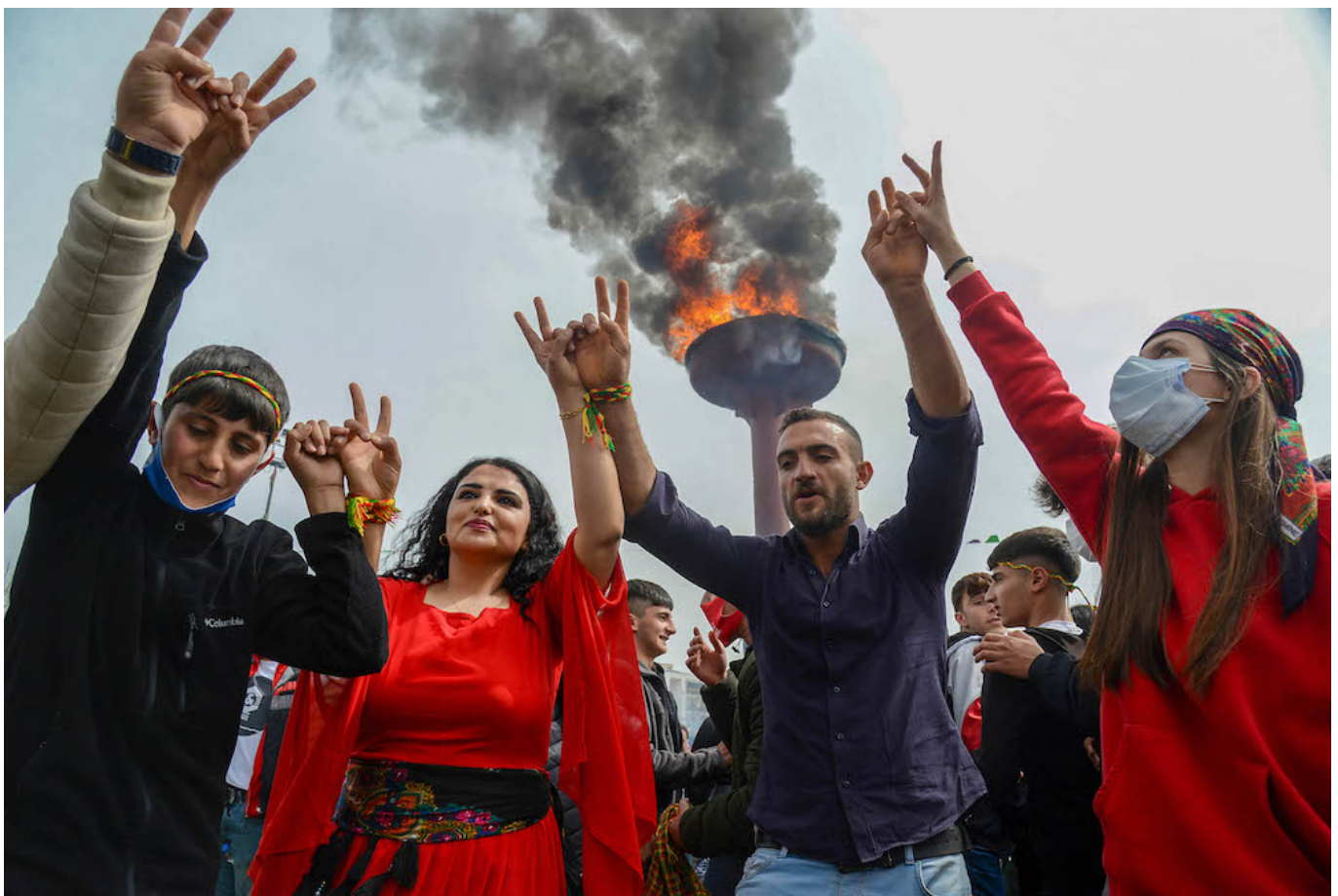
Supporters of pro-Kurdish Peoples' Democratic Party (HDP) cheer around fire during a gathering to celebrate Nowruz, the Persian New Year, in Diyarbakir on March 21, 2021.

These days, of course, almost no one thinks Turkey's judiciary is actually independent. This includes Turks. A 2016 public opinion poll conducted by the Eurasia Public Opinion Poll Center, conducted before the worst of the Erdogan government's moves to take over the judiciary, showed that "a total of 97.1 percent of Turks do not believe the judiciary in Turkey is independent and have no trust in the court system."