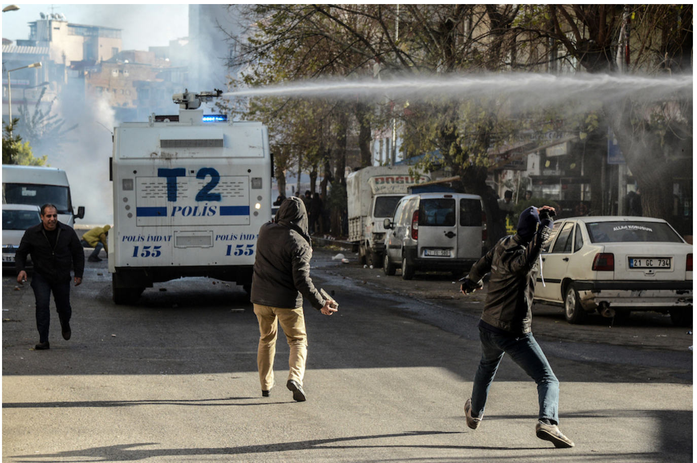
Protesters throws stones towards a water cannon during a demonstration in Diyarbakir on December 22, 2015 to denounce security operations against Kurdish rebels in southeastern Turkey.

The HDP, after the last couple of elections, has become Turkey's third-largest party, receiving close to 12 percent of the national vote and holding 55 seats in the Turkish Grand National Assembly. The US State Department spokesman called moves to close the HDP "a decision that would unduly subvert the will of Turkish voters, further undermine democracy in Turkey, and deny millions of Turkish citizens their chosen representation."