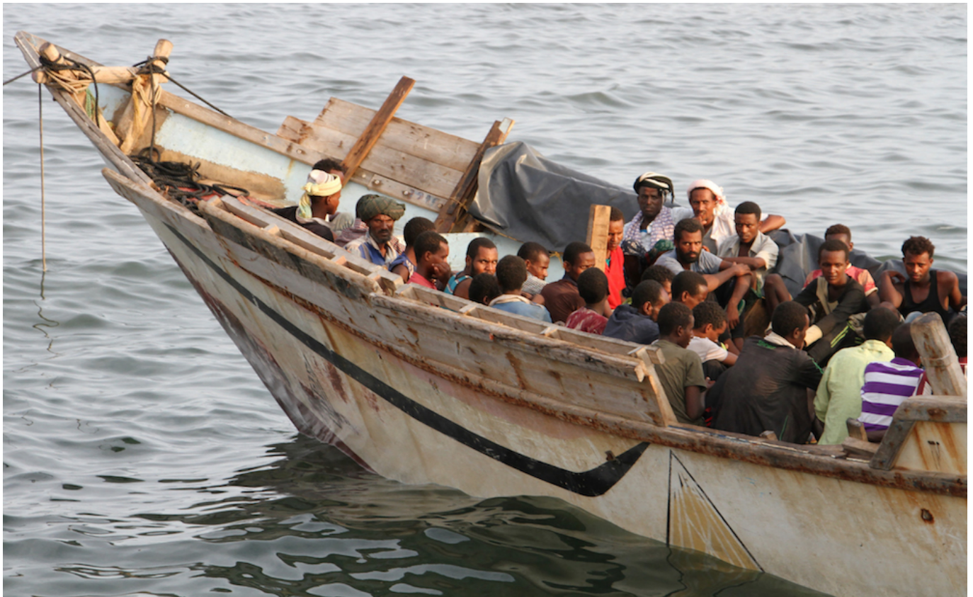
African illegal immigrants sit on a boat in the southern port city of Aden on September 26, 2016, before being deported to Somalia.

Since then, local chapters of the group have sprung up worldwide to monitor police violence against black communities and to support grassroots empowerment.