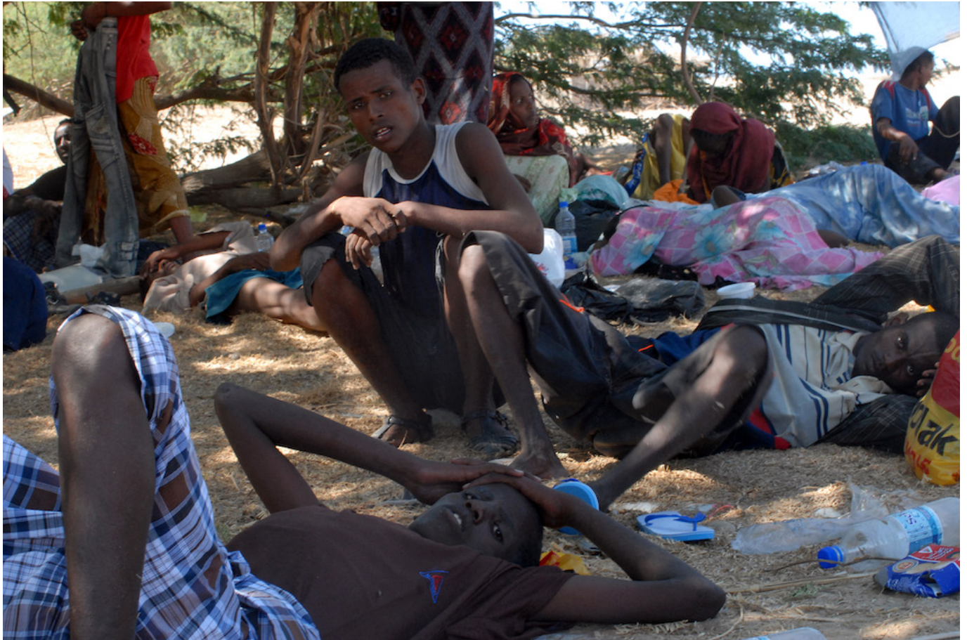
Newly arrived Somali migrants rest in the shade on the beach of Hasn Beleid village, 230 kms east of the Red Sea port of Aden.

"I have strong reason to believe that the news isn't paying attention because they're black people. It's my duty to fight for black people across the world."