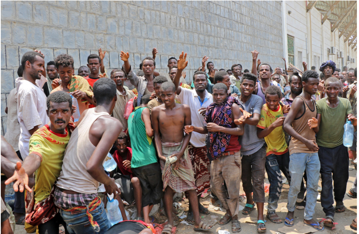
African migrants receive food and water inside a football stadium in the Red Sea port city of Aden in Yemen, on April 23, 2019.

Newsome, who is a lawyer by training, draws a direct parallel between the racist attitudes that have allowed US policemen and Houthi militiamen alike to kill black people in their custody.