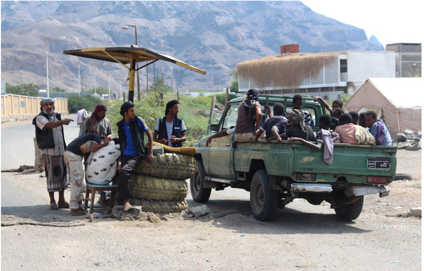
African migrants who were reportedly smuggled by sea into Yemen, sit on the back of a vehicle on the outskirts of the city of Aden.

Witnesses inside the hangar say the first projectile produced a lot of smoke and made their eyes water and sting.