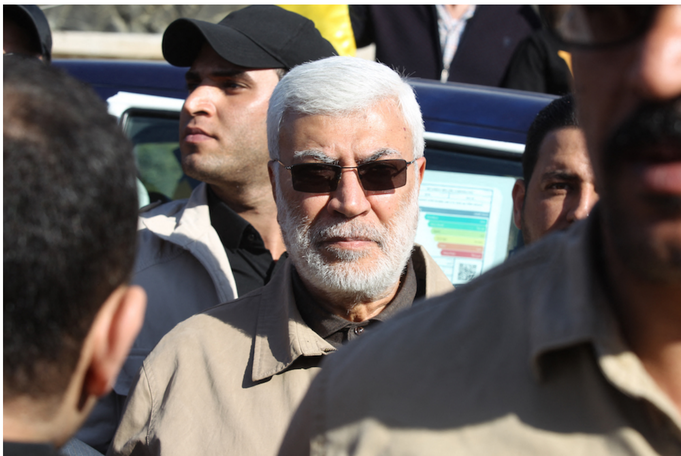
Abu Mahdi Al-Muhandis, head of the Kataib Hezbollah, was killed beside Iranian commander Qassem Soleimani at Baghdad’s international airport.