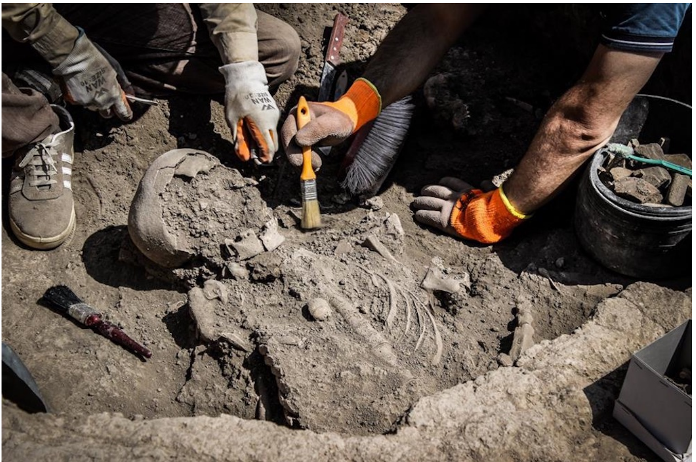
German and Kurdish archaeologists uncover the skeleton remains of a woman thought to date from the Hellenistic period (323 BC to 31 BC) near the northern Iraqi city of Duhok.

The researchers uncovered millions of novel genetic variants that are common to the region but considered rare elsewhere in the world. The knowledge gained in the process enabled the analysis of local genomic structures in immense detail for the first time.