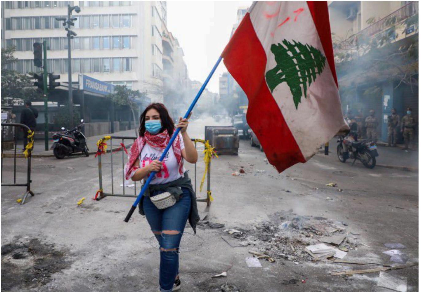
A demonstrator carries a national flag along a blocked road during a protest against the mounting economic hardships near the Central Bank building in Beirut on March 16, 2021.

subsidies on fuel is not politically driven. It is economically driven,” Ramady told Arab News.