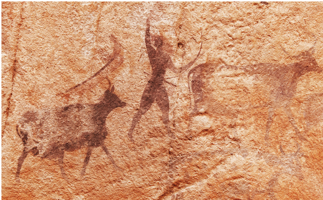
Famous prehistoric rock paintings of Tassili N'Ajjer, Algeria.