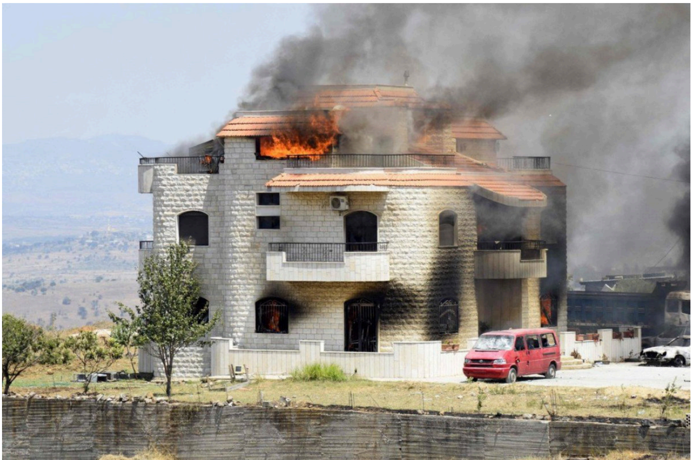
Fire devours a building close to where a fuel tank exploded in Lebanon’s northern region of Akkar on August 15, 2021.

“Sometimes I get called into areas that are outside my town. These are people that are in pain and I would love to help them, but I can’t even reach them,” he told Arab News.