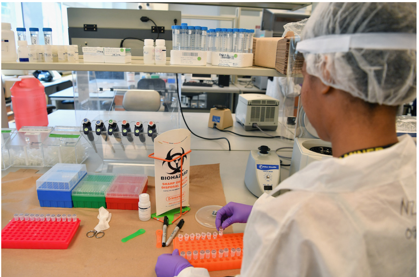
A lab worker prepares liquids for DNA extraction.

“The underrepresentation limits our understanding of the genomics and the implications of disease on these populations, so we wanted to fill those gaps that we see in the literature.”