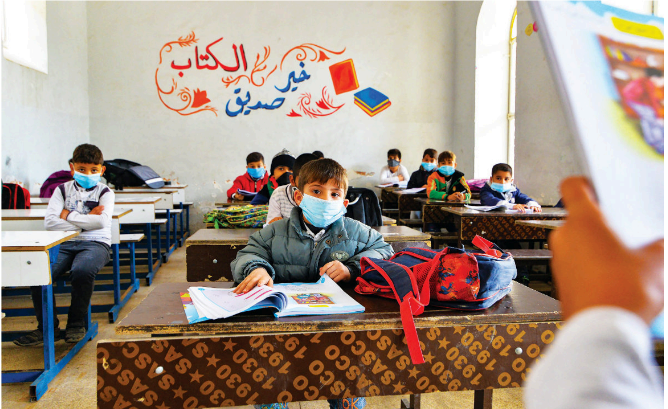
Iraqi pupils wearing face masks attend class on the first day of the new academic year in Mosul.

Now, with new variants of concern emerging such as the omicron strain, and infections again on the rise in many parts of the world, it increasingly looks as if remote learning, instead of being a stopgap, is here to stay.