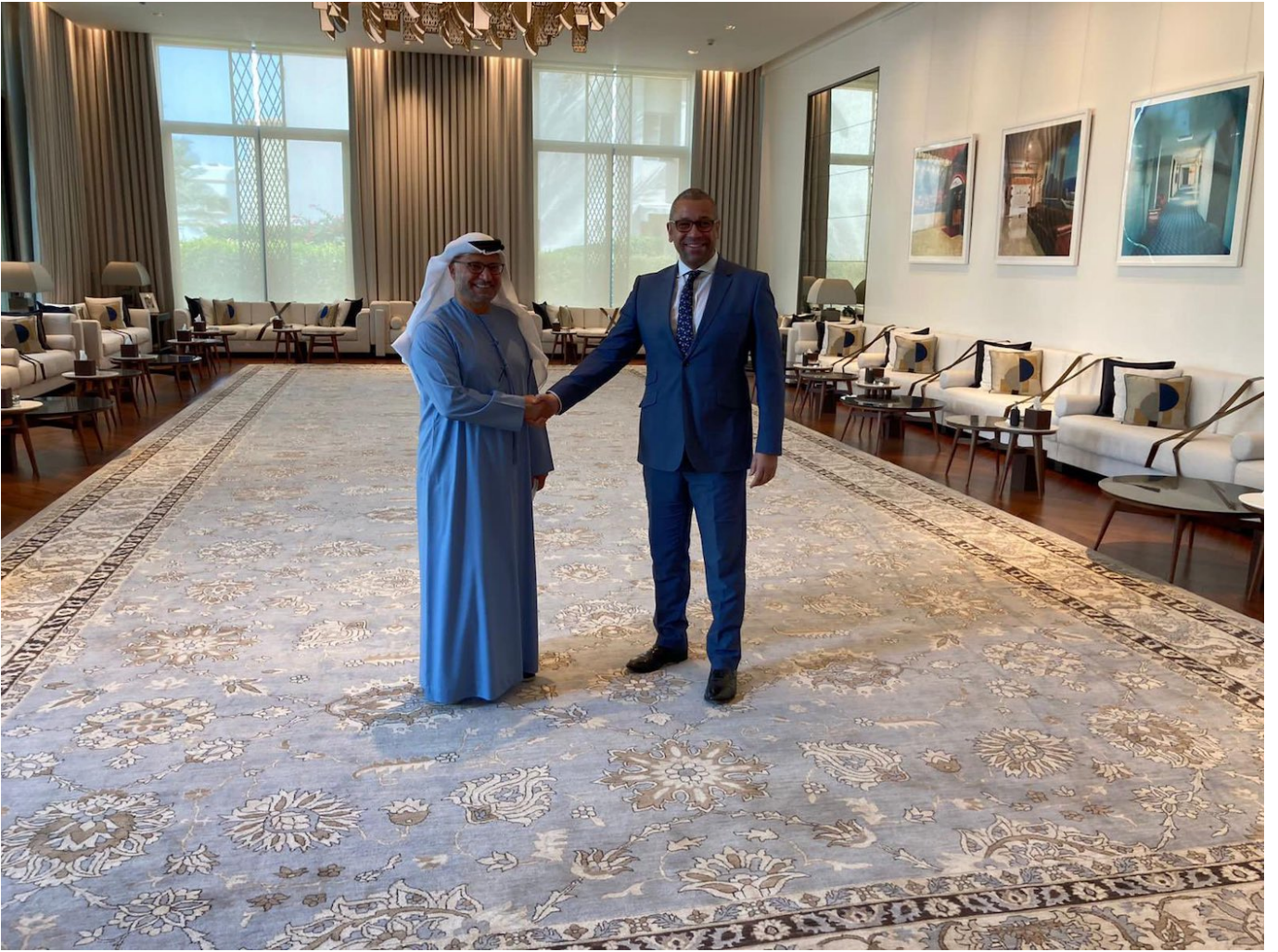
James Cleverly meets Anwar Gargash in the UAE.