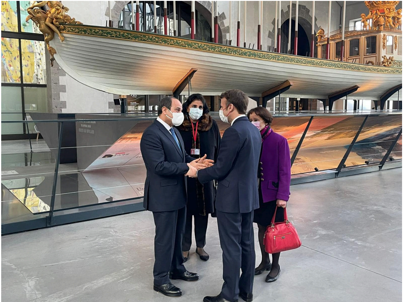
Ursula von der Leyen, Norwegian Prime Minister Jonas Gahr Store, and Tunisian Prime Minister Najla Bouden on the sidelines of the summit.