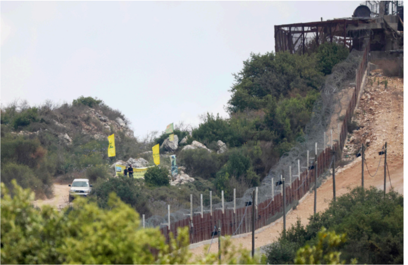
Main category: Middle-East