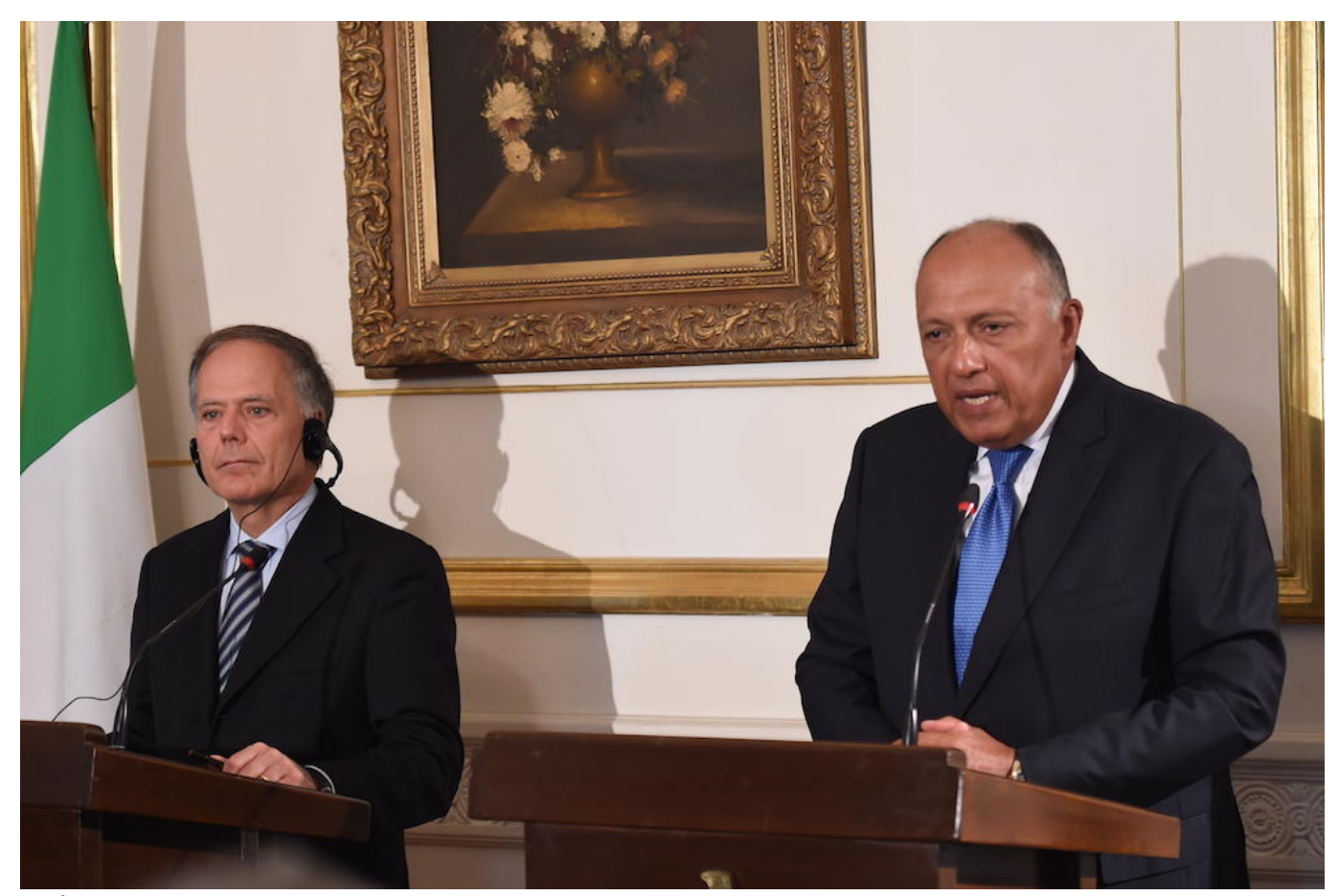
Main category: <u>Middle-East</u>