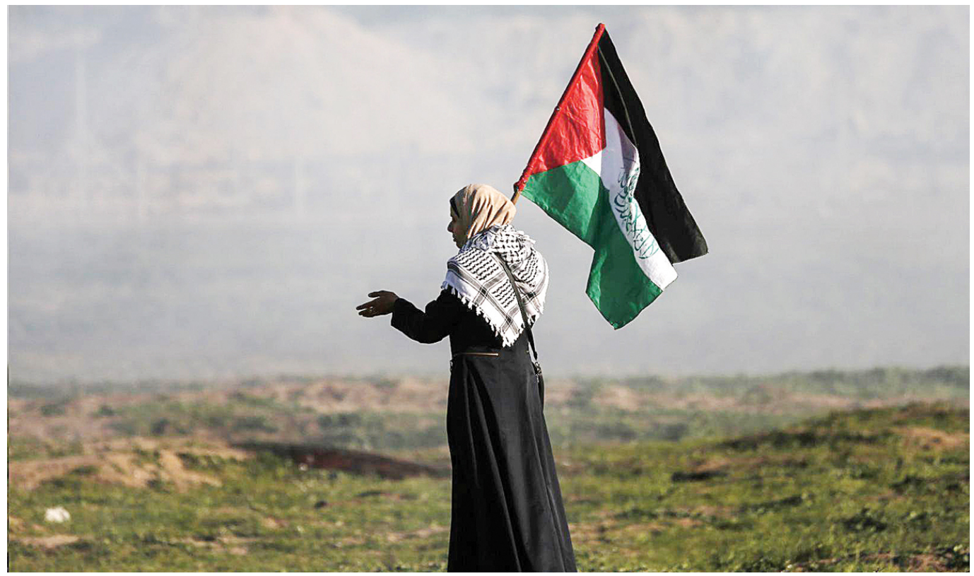
Main category: <u>Middle-East</u> Tags: <u>israel elections</u>

Botrus Mansour, a Nazareth-based lawyer, told Arab News that Palestinian citizens of Israel can have a role in blocking the chances of Netanyahu's return to power. "Their role is important in that they can participate in a blocking coalition that prevents Netanyahu from returning to power even if a left-wing government is not established."