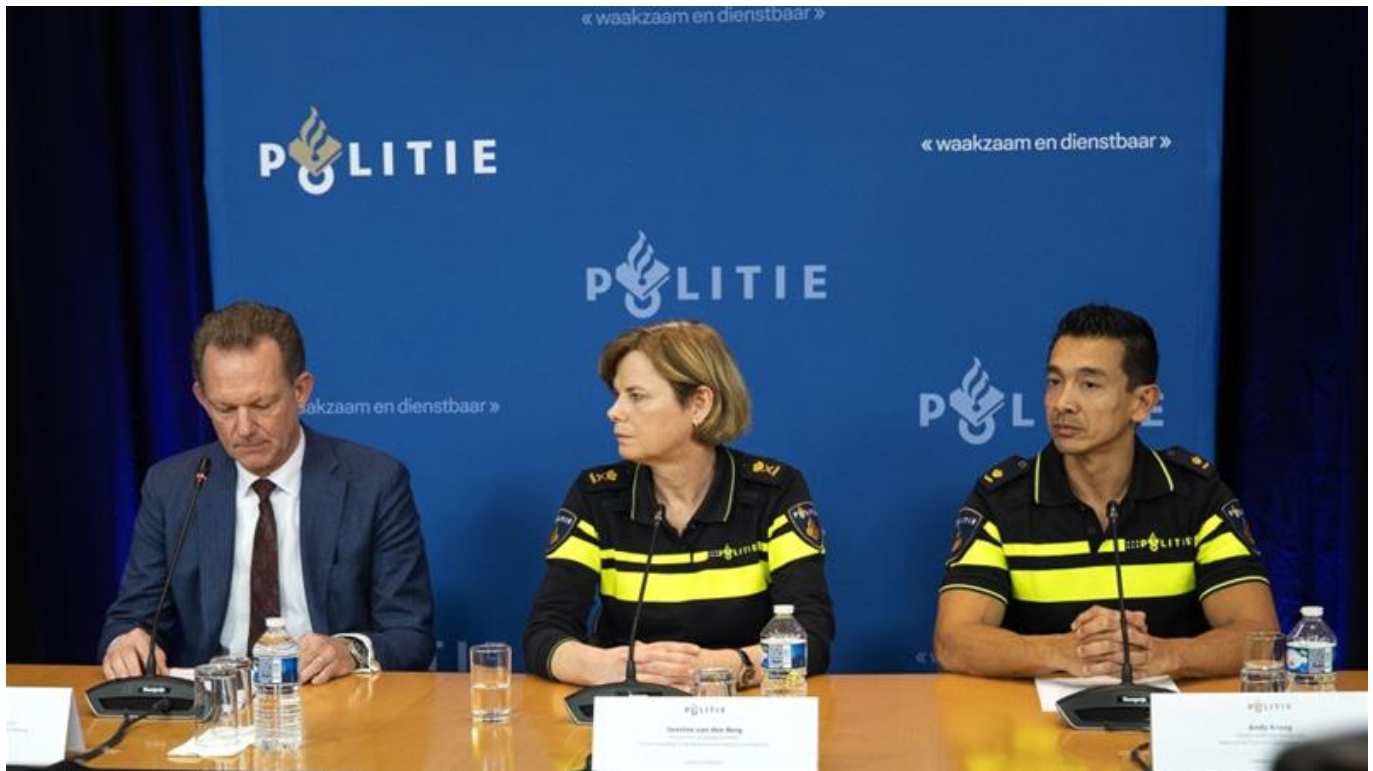
Dutch officials speak to the press after the announcement of the arrest of Ridouan Taghi.

The searches were in various locations including the capital Amsterdam and the central city of Utrecht.