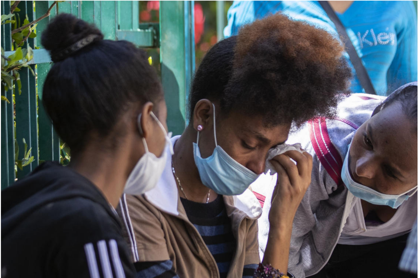
An Ethiopian domestic worker cries as she waits outside the Ethiopian consulate in Hazmieh, east of Beirut, Lebanon, on Thursday, June 4, 2020.

Dozens of Ethiopian workers gathered in front of the Ethiopian Embassy in Hazmieh in the eastern suburb of Beirut.