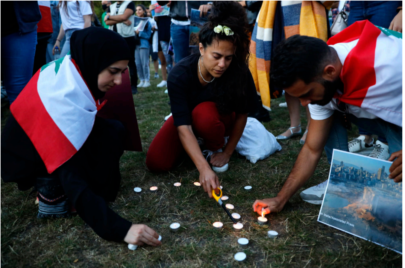
Lebanese light candles at a vigil held at Kensington gardens in central London to honor the victims of the Beirut blast on August 5, 2020.

22-year-old Jad said that he was seeking immigration, but changed his mind and decided to stay in the country after the explosion at Beirut's port: "We have not witnessed any wars, and when the 2006 aggression happened, we were kids".