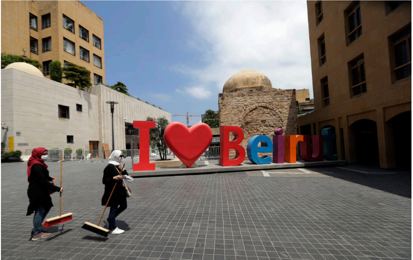
Volunteers clean the rubble and broken glass from the streets in downtown Beirut on August 6, 2020 in the aftermath of the massive explosion.

Yvon Azar said: “The streets are crowded because people are coming to Beirut to help. This is humanitarian work we should be proud of”.