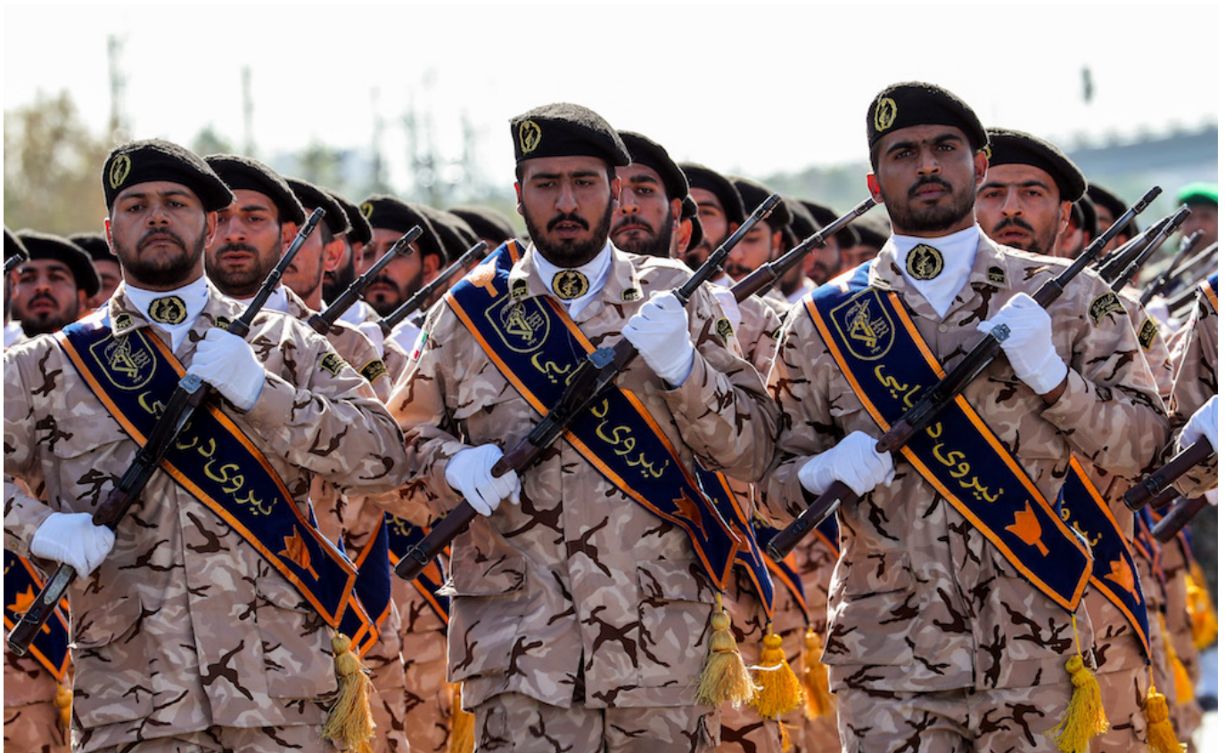
Members of Iran's Revolutionary Guards Corps (IRGC) march during the annual military parade marking the anniversary of the outbreak of the 1980-1988 war with Saddam Hussein's Iraq.

"In terms of ideology, yes, Al-Qaeda and Iran are enemies. In terms of power and political interests, however, they are natural allies."