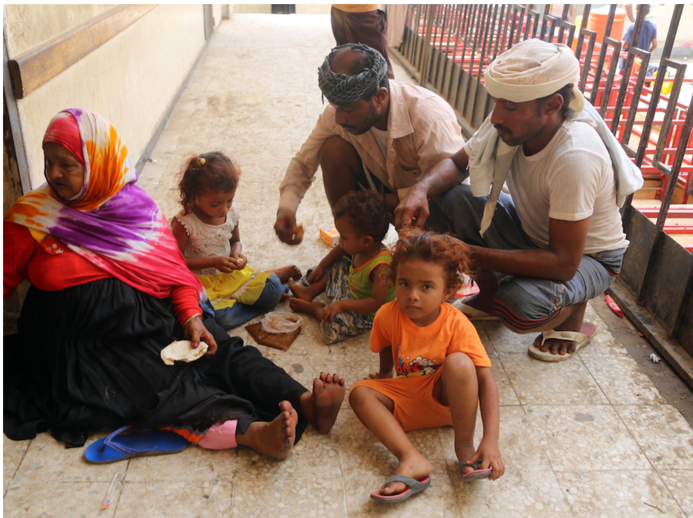
Members of displaced Yemeni families who fled battles between government forces and Houthi fighters near the Hodeidah airport share a meal on the balcony of of a school used as temporary housing inside the city.

The strategy was matched by a zero-tolerance approach to Iranian influence in Yemen, Iraq, Syria, Lebanon and Palestine, as well as to its role in harboring leaders and operatives of Al-Qaeda.