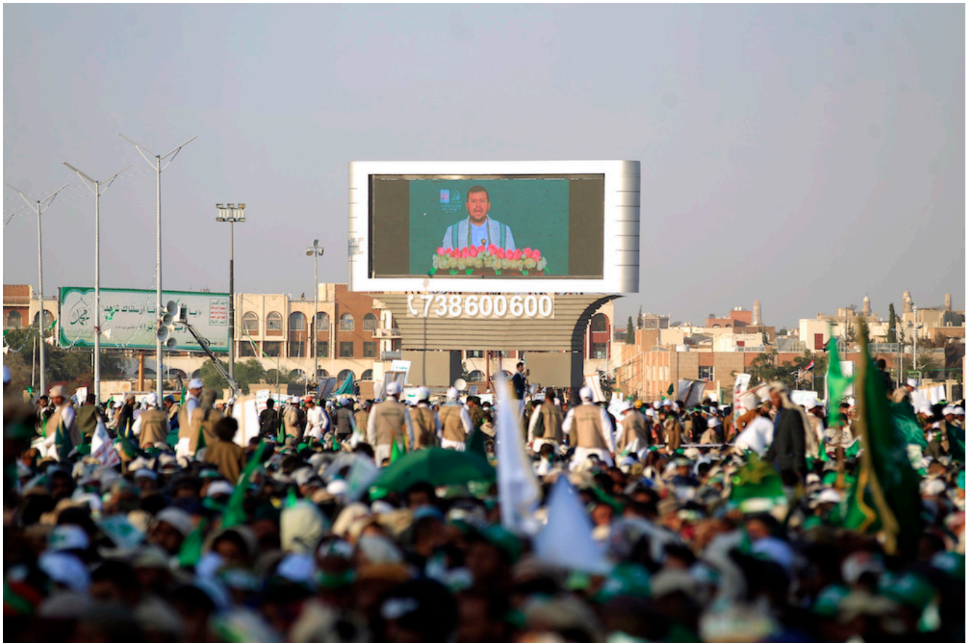
Houthi leader Abdul-Malik Al-Houthi delivers a speech in he Yemeni capital Sanaa on November 9, 2019.

Given this behavior, it is surprising that the Houthis did not land the terrorist designation then, although historians would probably chalk it up to the Obama administration's wish to preserve the 2015 Iran nuclear accord at any cost.