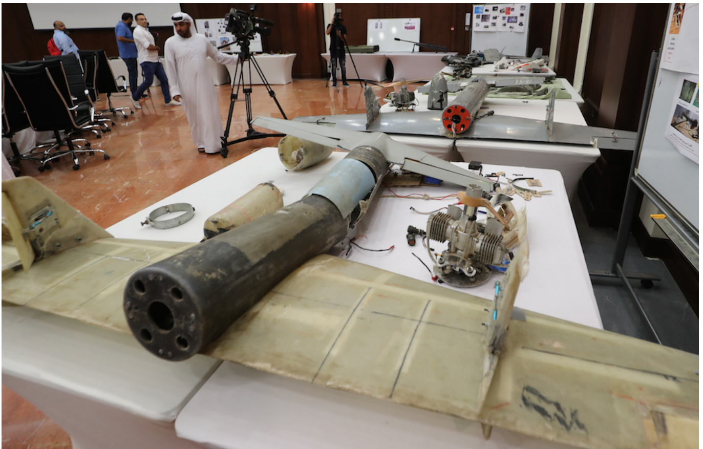
A picture taken on June 19, 2018 shows debris of Iranian-made Ababil drones displayed Abu Dhabi, which the Emirati armed forces say were used by Houthi rebels in Yemen in battles against the coalition forces led by the UAE and Saudi Arabia.

"The designations are also intended to advance efforts to achieve a peaceful, sovereign and united Yemen that is both free from Iranian interference and at peace with its neighbors."