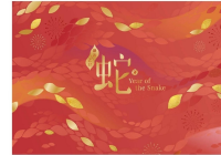
套摺(封面)。 Presentation Pack (Cover).