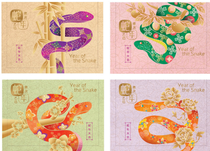
郵資已付生寫賀年卡(空郵郵資)。(一套四張)。 Postage Prepaid Lunar New Year Greeting Cards (Air Mail) (a set of 4 cards).