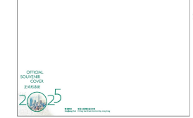
2025年紀念封(大型: 265毫米x 190毫米) 2025 Souvenir Cover (Large size: 265mm x 190mm)