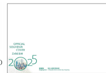
2025年紀念封(中型: 228毫米x 162毫米) 2025 Souvenir Cover (Medium size: 228mm x 162mm)