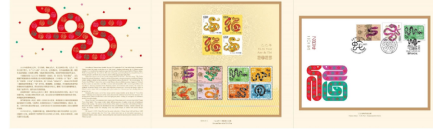
聯合紀念套摺(珍藏版)(內頁)。 Joint Souvenir Pack (Prestige) (Inside).