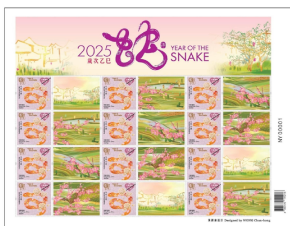
「心思心意郵票」小版張(空郵郵資)。 "Heartwarming Stamps" Mini-pane (Air Mail Postage).