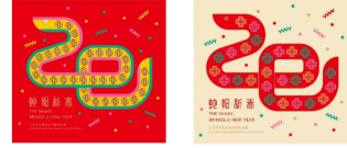
聯合紀念套摺(珍藏版)(封套)。 Joint Souvenir Pack (Prestige) (Envelope).