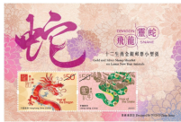
郵票小型張 (22K金箔燙壓、壓印及銀箔燙壓)。 Stamp Sheetlet (22-carat gold hot foil stamping, embossing and silver hot foil stamping)。