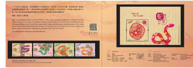
套摺(內頁)。 Presentation Pack (Inside).