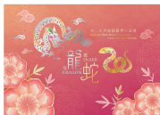
套摺(封面)。 Presentation Pack (Cover).