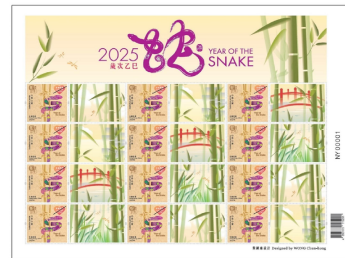
「心思心意郵票」小版張(本地郵資)。 "Heartwarming Stamps" Mini-pane (Local Mail Postage).