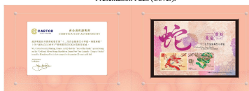
套摺(內頁)。 Presentation Pack (Inside).