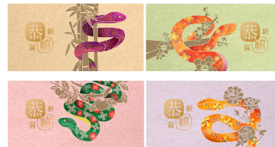
利是封(每包20個,共四款設計)。 Red Packets (A pack of 20 pieces with four designs).