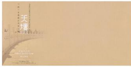
First Day Cover.