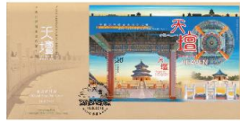
Serviced First Day Cover: affixed with a Stamp Sheetlet.