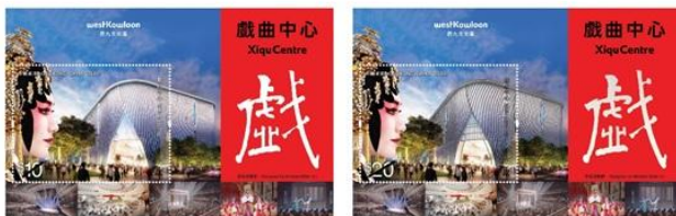
Stamp Sheetlet (containing a $10 stamp).