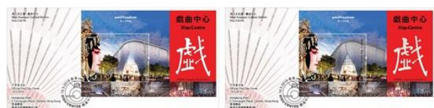
Serviced First Day Cover affixed with a $10 Stamp Sheetlet.