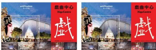
Stamp Sheetlet (containing a $10 stamp).