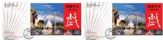
Serviced First Day Cover affixed with a $10 Stamp Sheetlet.