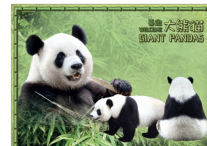
郵資已付圖片卡 (空郵郵資) (一套三張) Postage Prepaid Picture Cards (Air Mail) (A set of 3 cards)