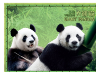
喜迎大熊貓 Welcome Giant Pandas