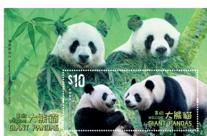
10元郵票小型張 $10 Stamp Sheetlet