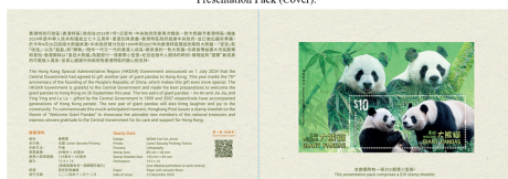
套摺 (內頁) Presentation Pack (Inside)