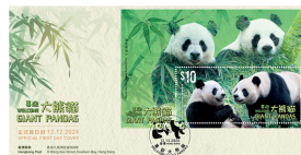
已蓋銷首日封連10元郵票小型張 (以特別郵戳蓋銷) Serviced First Day Cover affixed with a $10 Stamp Sheetlet (date-stamped with associated special postmark)