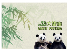
套摺 (封面) Presentation Pack (Cover)