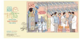
Serviced First Day Cover affixed with a Stamp Sheetlet (in gratitude for the Central Government's support to Hong Kong's anti-epidemic efforts) and date-stamped with associated special postmark.