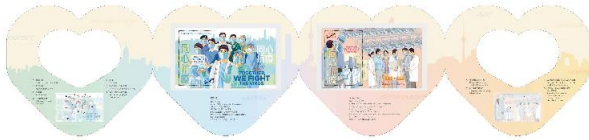
Presentation Pack (Inside).