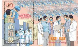
Stamp Sheetlet (in gratitude for the Central Government's support to Hong Kong's anti-epidemic efforts).