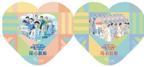
Presentation Pack (Dual covers).