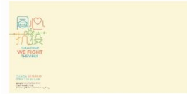
First Day Cover.