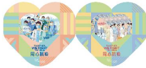
Presentation Pack (Dual covers).