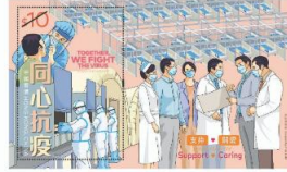
Stamp Sheetlet (in gratitude for the Central Government's support to Hong Kong's anti-epidemic efforts).