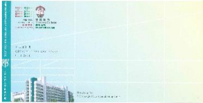
First Day Cover.