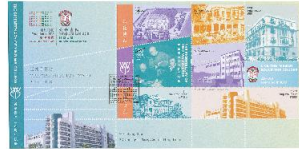
Serviced First Day Cover affixed with a Stamp Sheetlet.