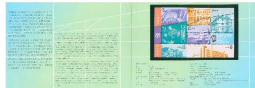
Presentation Pack (Inside).