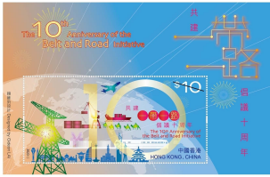
Stamp Sheetlet. 郵票小型張。