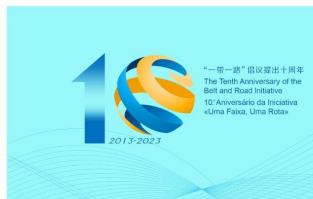
Stamp Booklet (Cover). 郵票小冊子（封面）。