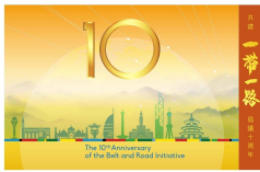
Presentation Pack (Cover). 套摺（封面）。