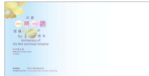
Official First Day Cover. 正式首日封。