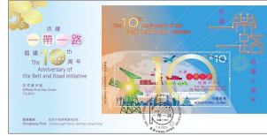
Serviced First Day Cover affixed with a Stamp Sheetlet (date-stamped with associated special postmark) 貼有一張郵票小型張的已蓋銷首日封 （以相關的特別郵戳蓋銷）。