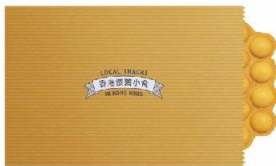
Presentation Pack (Cover).