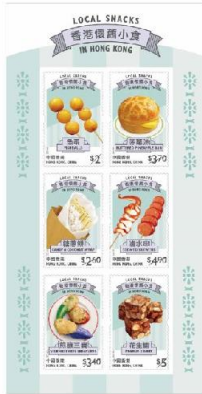
Collector Card (Front).