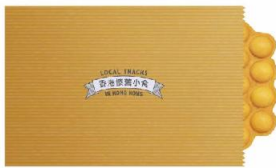
Presentation Pack (Cover).