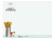
First Day Cover.