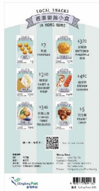
Collector Card (Back).