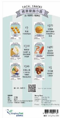
Collector Card (Back).