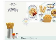
Serviced First Day Cover affixed with a Stamp Sheetlet and date-stamped with associated colour postmark.