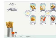
Serviced First Day Cover affixed with a set of 6 Stamps and date-stamped with associated colour postmark.