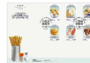
Serviced First Day Cover affixed with a set of 6 Stamps and date-stamped with associated special postmark.