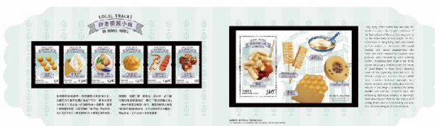
Presentation Pack (Inside).