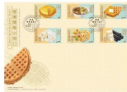
Serviced First Day Cover affixed with a set of mint stamps in six denominations (date-stamped with associated special postmark).