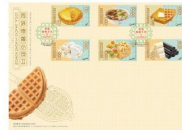
Serviced First Day Cover affixed with a set of mint stamps in six denominations (date-stamped with associated colour postmark).