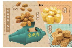
Stamp Sheetlet. 郵票小型張。