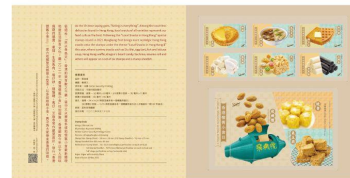
Presentation Pack (Inside). 套摺(內頁)。