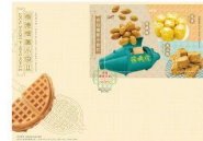
Serviced First Day Cover affixed with a $10 Stamp Sheetlet (date-stamped with associated colour postmark). 貼有一張10元郵票小型張的已蓋銷首日封 (以相關的彩色郵戳蓋銷)。