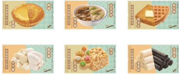
Mint Stamps. 郵票。