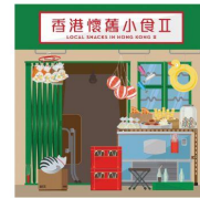
Presentation Pack (Cover). 套摺(封面)。