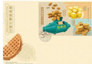
Serviced First Day Cover affixed with a $10 Stamp Sheetlet (date-stamped with associated special postmark). 貼有一張10元郵票小型張的已蓋銷首日封 (以相關的特別郵戳蓋銷)。