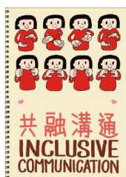
Presentation Pack (Cover).