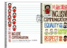
Serviced First Day Cover affixed with a stamp sheetlet.