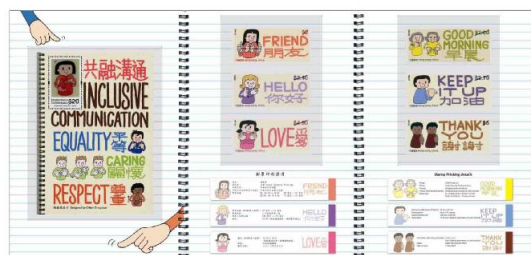
Presentation Pack (Inside).