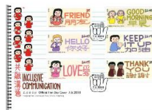
Serviced First Day Cover affixed with a set of 6 stamps.