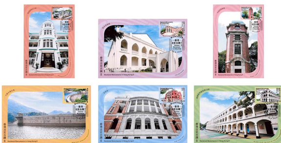
Maximum Cards A set of 6 cards affixed with the relevant stamp on the picture side (date-stamped with the associated special postmark). 貼附明信片 一套六款，在印有圖案的一面貼上相關郵票 (以相關的特別郵戳蓋銷)。