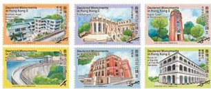
Mint Stamps. 郵票。