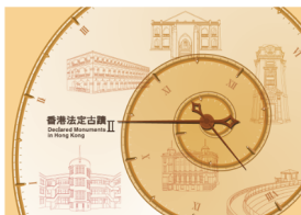
Presentation Pack (Cover). 套摺 (封面)。