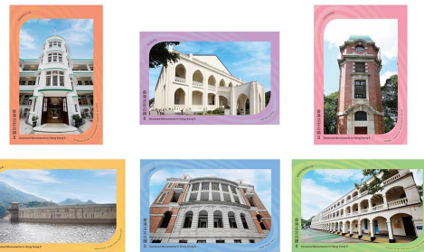
Postcards (a set of 6 cards). 明信片 (一套六款)。