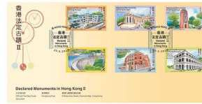
Serviced First Day Cover affixed with a set of mint stamps in six denominations (date-stamped with associated special postmark). 貼有一套六款面額郵票的已蓋銷首日封 (以相關的特別郵戳蓋銷)。