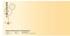
Official First Day Cover. 正式首日封。