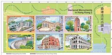
Souvenir Sheet. 小全張。