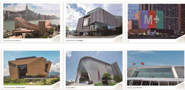
Postcards (a set of 6 cards) 明信片(一套六款)。