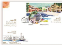
Serviced First Day Cover affixed with a $10 Stamp Sheetlet (date-stamped with the associated special postmark).