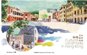
$10 Stamp Sheetlet. 10元郵票小型張。