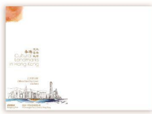
Blank First Day Cover. 空白首日封。