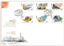
Serviced First Day Cover affixed with a set of mint stamps in six denominations (date-stamped with the associated special postmark).