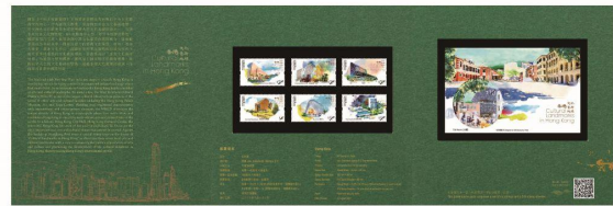
Presentation Pack (Inside). 套摺(內頁)。