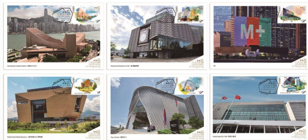
Maximum Cards A set of 6 cards affixed with the relevant stamp on the picture side (date-stamped with the associated special postmark).