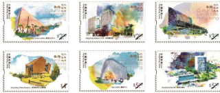
Mint Stamps. 郵票。