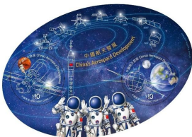
Stamp Sheetlet. 郵票小型張。