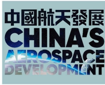
Presentation Pack (Cover) 套摺(封面)