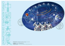
Serviced First Day Cover affixed with a Stamp Sheetlet (date-stamped with special postmark). 貼有一張郵票小型張的已蓋銷首日封 (以特別郵戳蓋銷)。