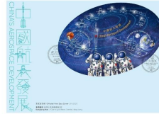
Serviced First Day Cover affixed with a Stamp Sheetlet (date-stamped with special postmark) 貼有一張郵票小型張的已蓋銷首日封 (以特別郵戳蓋銷)