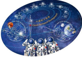
Stamp Sheetlet 郵票小型張