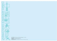
Official First Day Cover. 正式首日封。