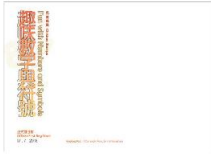
First Day Cover