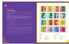
Souvenir Pack (Inside).