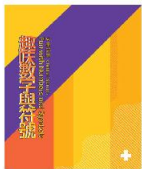
Souvenir Pack (Cover).