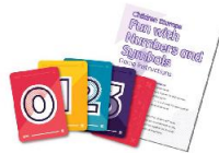
A set of 61 playing cards and game instructions.