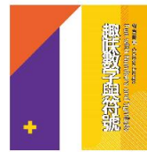
Presentation Pack (Cover).