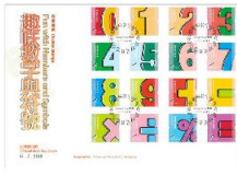
Served First Day Cover filled with a set of 16 stamps.