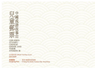
Official First Day Cover. 正式首日封。