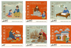
Mint Stamps. 郵票。