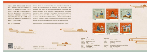
Presentation Pack (Inside). 套摺 (內頁)。