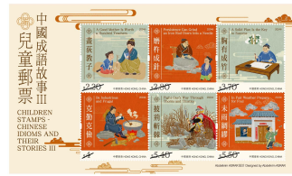
Souvenir Sheet. 小全張。