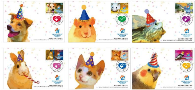
Maximum Cards A set of six cards each depicting one animal showed in the mint stamp and affixed with the corresponding mini stamp on the picture side (date-stamped with a corresponding colour postmark).

Centenary of the Society for the Prevention of Cruelty to Animals (Hong Kong)