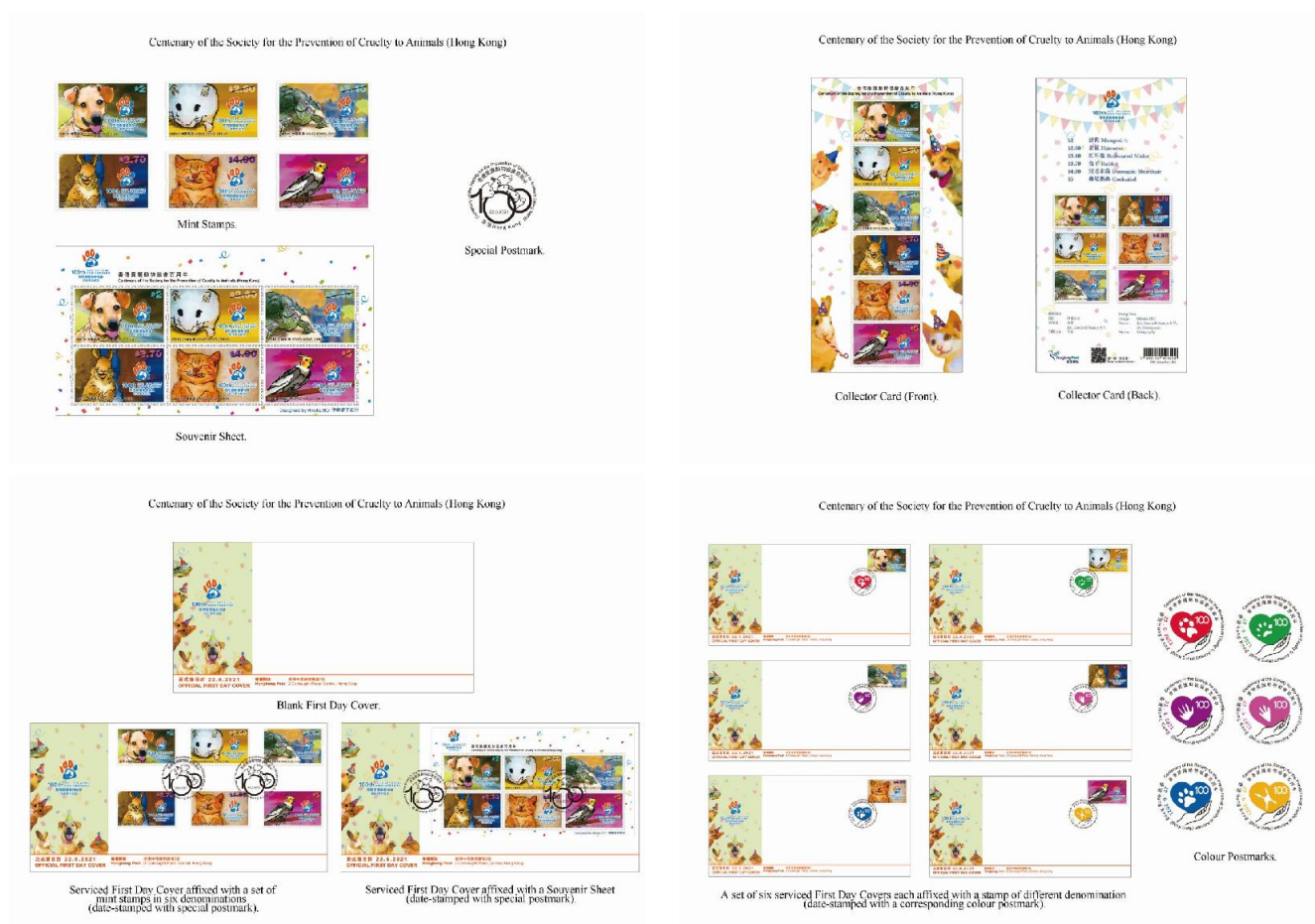
Centenary of the Society for the Prevention of Cruelty to Animals (Hong Kong)

Information about this commemorative stamp issue and associated philatelic products is available on the Hongkong Post Stamps website ( stamps.hongkongpost.hk ) or the Hongkong Post mobile app.