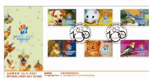
Serviced First Day Cover affixed with a set of mint stamps in six denominations (date-stamped with special postmark).