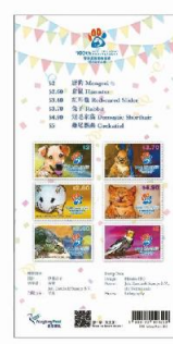
Collector Card (Back).