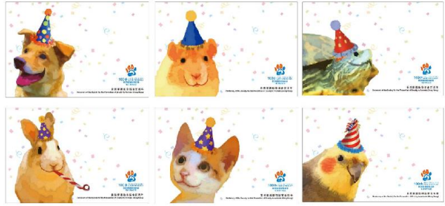
Postcards (a set of six cards).

Centenary of the Society for the Prevention of Cruelty to Animals (Hong Kong)