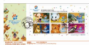
Serviced First Day Cover affixed with a Souvenir Sheet (date-stamped with special postmark).