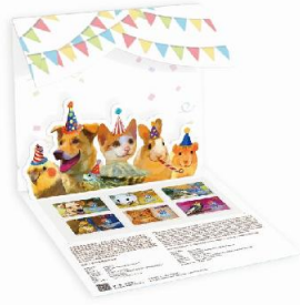
Presentation Pack (Inside).

Centenary of the Society for the Prevention of Cruelty to Animals (Hong Kong)