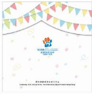
Presentation Pack (Cover).

Centenary of the Society for the Prevention of Cruelty to Animals (Hong Kong)