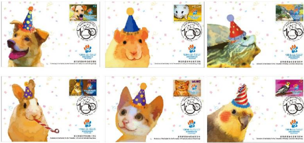
Maximum Cards A set of six cards each depicting one animal showed in the mint stamp and affixed with the corresponding mini stamp on the picture side (date-stamped with special postmark).

Centenary of the Society for the Prevention of Cruelty to Animals (Hong Kong)