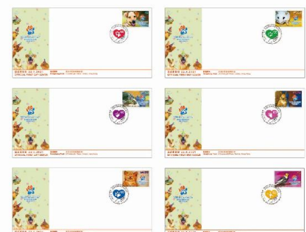
A set of six serviced First Day Covers each affixed with a stamp of different denomination (date-stamped with a corresponding colour postmark).