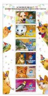
Collector Card (Front).