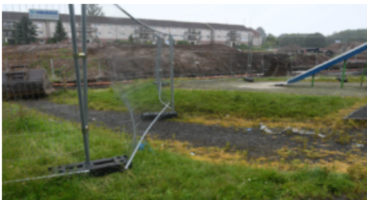
The construction site adjacent to Glenkirk

The HSE investigation also found that R.J. McLeod (Contractors) Limited, the company in charge of the site, had failed to carry out a suitable and sufficient assessment of the risk of unauthorised persons gaining access to the site, which resulted in a failure to adequately inspect and maintain suitable perimeter fencing, and install other suitable security measures. HSE guidance on protecting the public can be found here: Public protection – construction industry health & safety (hse.gov.uk)