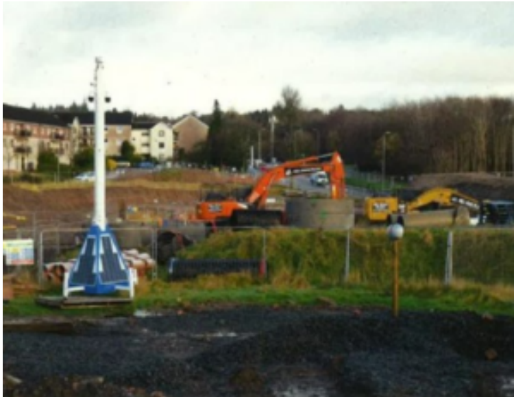
The construction site adjacent to Glenkirk Drive

The construction site was part of a surface water management project being carried out adjacent to Glenkirk Drive in the Drumchapel area of Glasgow on behalf of Glasgow City Council.