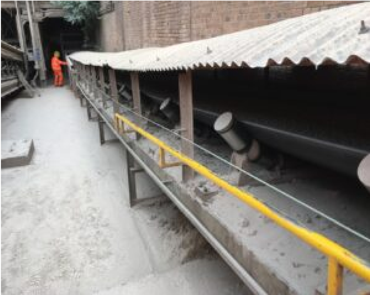
The conveyor at Mountsorrel Quarry