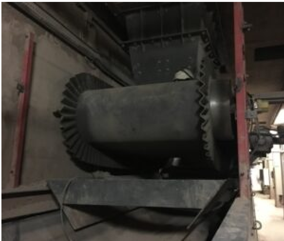
The feed hopper and conveyor at Mountsorrel Quarry

A Health and Safety Executive (HSE) investigation into this incident found Tarmac Aggregates Limited had failed to ensure the feed hopper was properly isolated before the repair work commenced. The test button on the conveyor electrical panel was not connected to the test circuit and was therefore inoperative. This issue appears to have existed for many years before the incident, meaning Tarmac Aggregates Limited failed to ensure critical defects were recorded and rectified in a timely manner. The company should have also provided a visual and audible pre-start alarm for the conveyor.