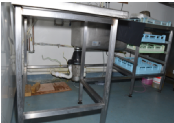
Bishops Wood Hospital kitchen area – sink and macerator underneath

The 36-year-old, who was originally from Stevenage, Hertfordshire, but lived in Letchworth, came into contact with a metal section of the macerator that had been electrified as water had entered the machine's wiring.