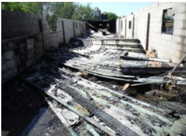
The extent of the damage following the fire at Yorkshire Game Farm

Leeds Magistrates' Court heard that the employee had been installing gas heaters in a pheasant rearing shed, ready for a new crop of birds. Upon turning on the gas supply and lighting the heaters, the shed burst into flames, causing him significant burns and totally destroying the shed.