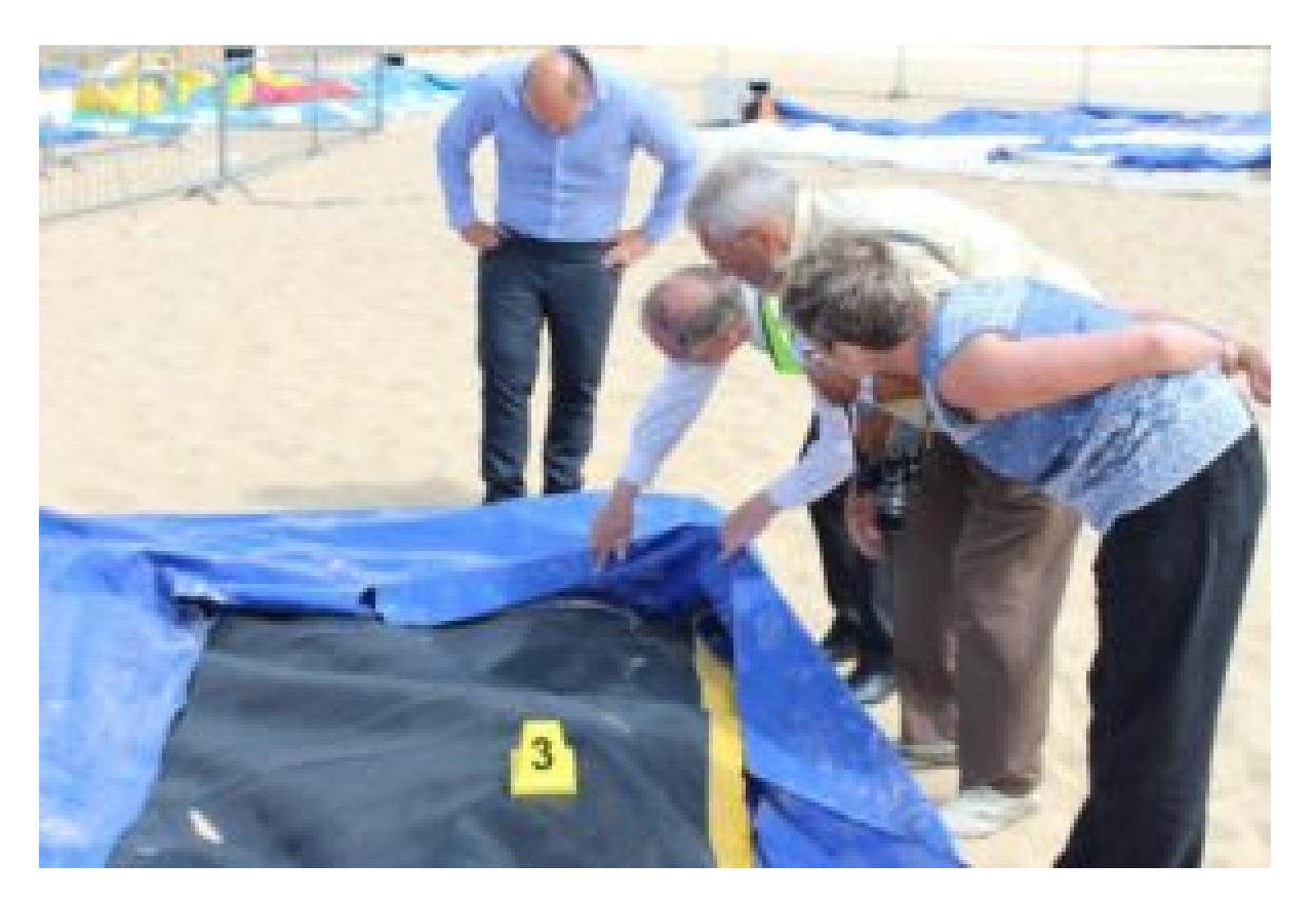
HSE's long-established guidance can be found at: <u>Health and safety guidance</u> <u>for fairgrounds (hse.gov.uk)</u>. Guidance more specific to sealed inflatables can be found at: <u>Sealed inflatables</u>: <u>safe supply, inspection and operation — Overview — HSE</u>.

Chloe Littleboy, Ava-May's mother, said: "Birthdays are always at her bench in the park. Balloons, flowers, cakes and sweets decorate it and the whole family go there together to celebrate. That's now the family 'thing', spending her birthday, Christmas and the anniversary of her death all together."