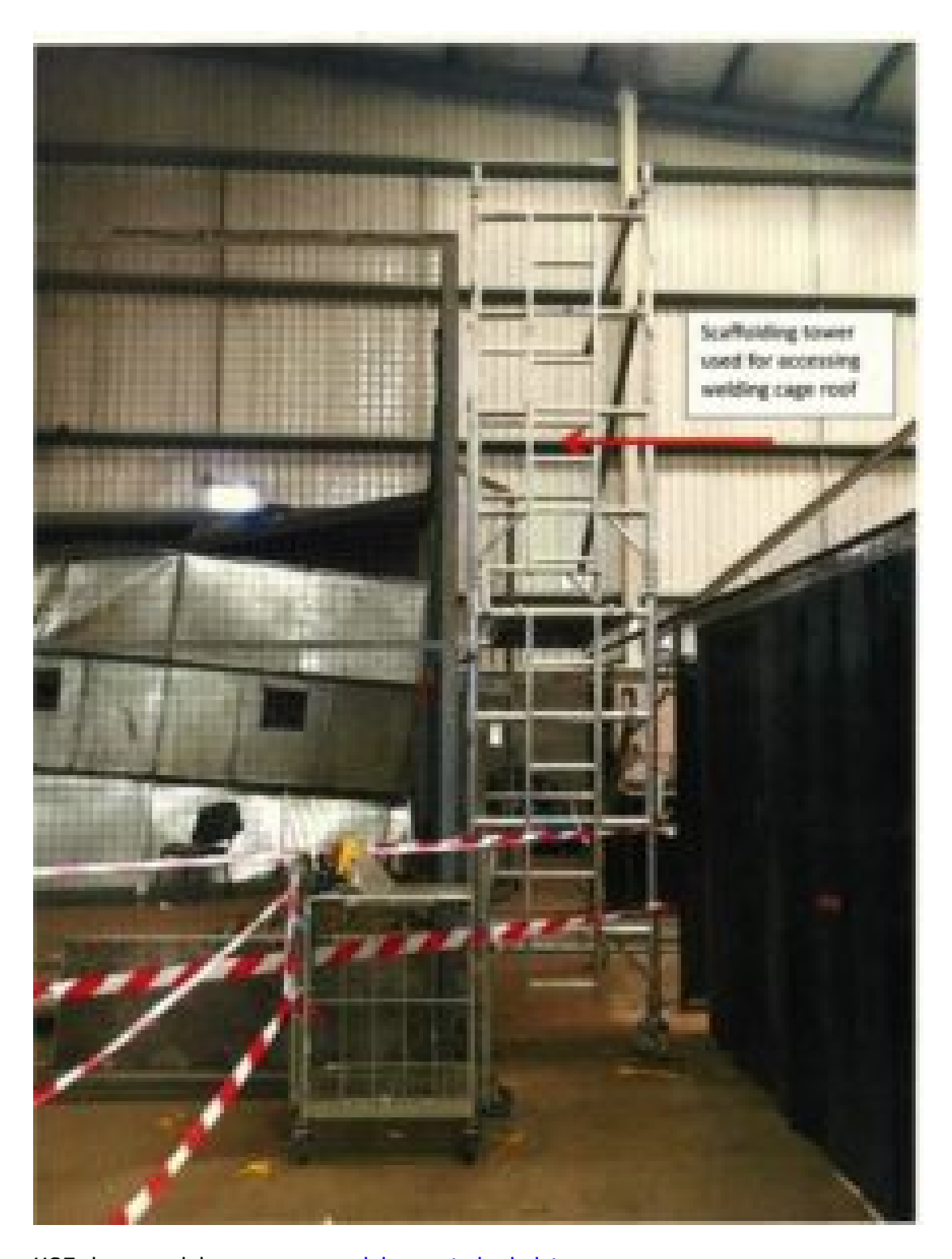
HSE has guidance on working at height.

At Birmingham Magistrates' Court on 10 November 2023, Wanzl Limited of Heathcote Lane, Warwick pleaded guilty to breaching Regulation 4 (1) of the Working at Height Regulations 2005. The company was fined £320,000 and ordered to pay costs of £4016.35.